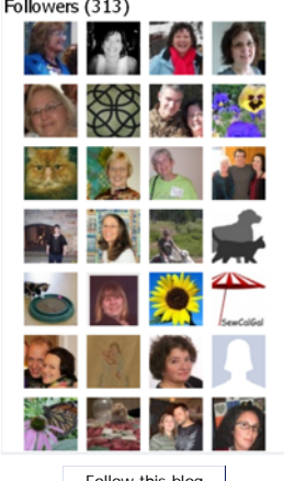
Follow this blog