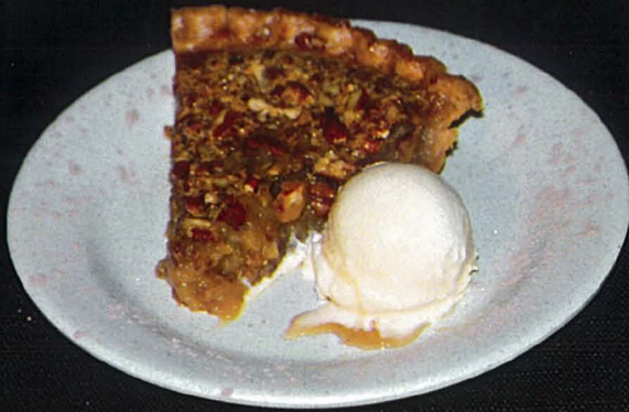
The Luscious Pecan Pie a la Mode