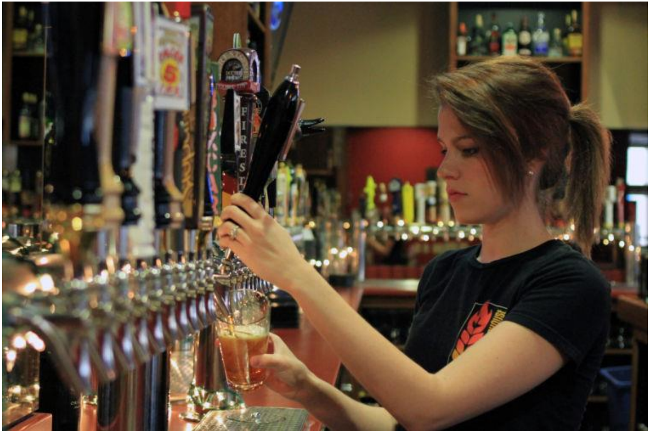
Fresh Pour at Federal Taphouse, Harrisburg

To add a bit more beer back into this geek-heavy itinerary, head to Federal Taphouse . The menu is a mix of solid gastropub staples like ample burgers, wood-fired pizza, and short rib entrees. But the big get here is the 100 beers on tap (yes, one hundred )! Instead of padding their beer list with low-hanging fruit like Sam Adams and Coors, the Taphouse offers a carefully culled selection of killer craft beers. Expect unique offerings like Oak Aged Yeti (from Denver’s Great Divide Brewing), Gnarleywine (Lagunitas), and Double Jack Imperial IPA (California’s Firestone Walker).