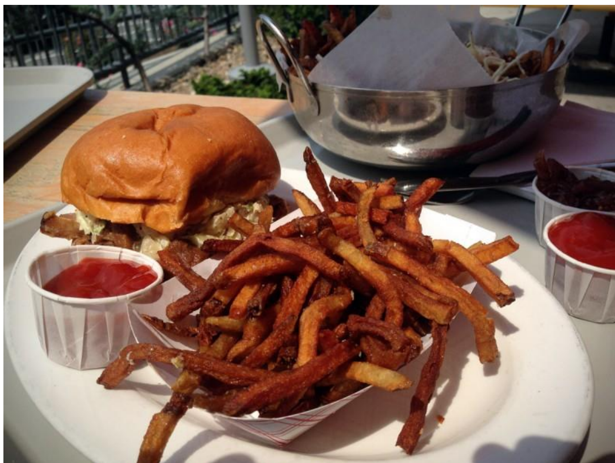
Lunch at Snack Bar at Troegs Brewery, Hershey

Since you just got into town, why not jump right into ... day-drinking. The Harrisburg/Hershey region is home to a growing number of killer craft breweries. The big, fat, hoppy elephant in the room is, of course, Troegs Brewing . Their shiny new brewery — complete with a 5,000 square foot tasting room — just outside the city also happens to be home to the affectionately (and totally inaccurately) named Snack Bar . Having sampled nearly everything on the menu here, I can safely say that damn-near-everything is fantastic, although the Hop Fries and Crispy Pork Belly are particularly noteworthy. All of which is a great lead-up to the actual beer tasting at Troegs which is equally as phenomenal.