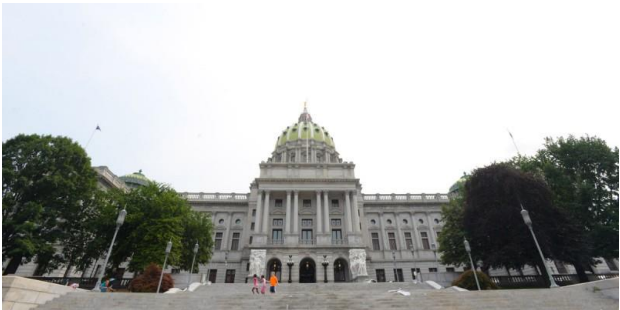
Pennsylvania State Capitol in Harrisburg