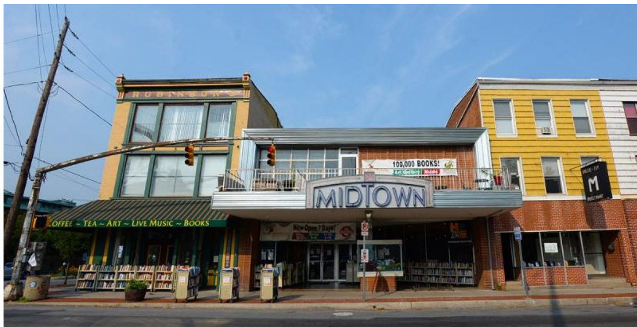
Midtown Scholar Bookstore in Harrisburg, Pennsylvania

Unless you're a complete nerd (*cough* me *cough*), hanging out a bookstore isn't your idea of riveting fun and excitement. But Midtown Scholar is arguably the coolest bookstore in the eastern United States. What started as a simple hobby in the owners' garage has grown into a mecca to all things reading.