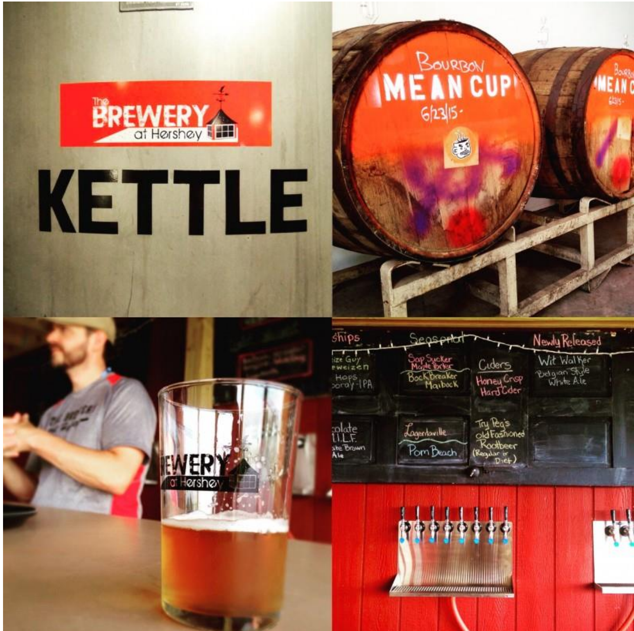
The Brewery at Hershey, Pennsylvania

... and More Beers at the Brewery at Hershey