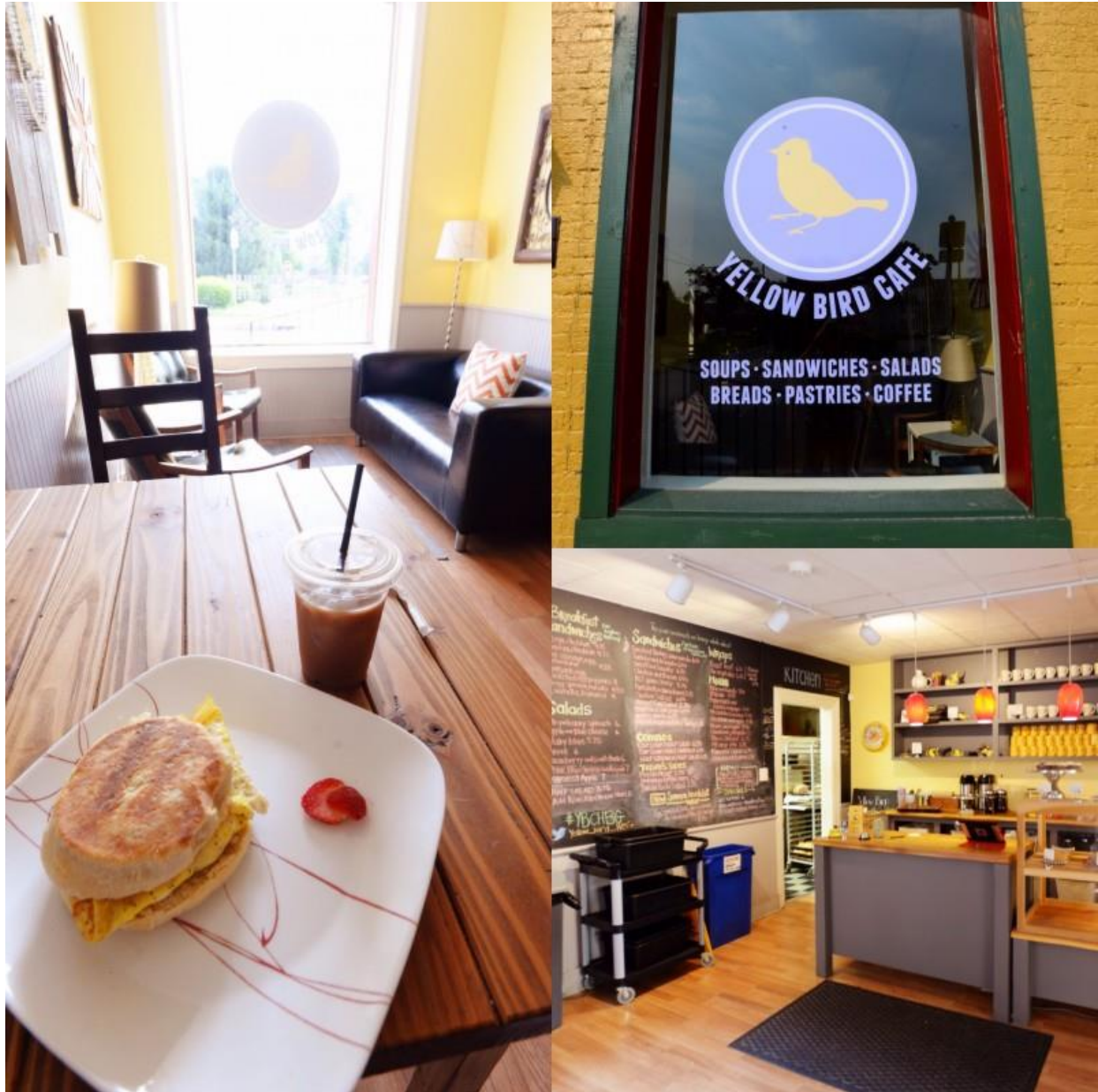
Yellow Bird Cafe in Harrisburg, PA

It's easy to see why locals love Yellow Bird Cafe . It's enough of a walk outside of downtown to keep the tourist crowds away and the interior feels a little like relaxing in a friend's living room (a friend with really good taste and equally good coffee). It's the ideal place to put on your best ascot, sip a non-fancy coffee, and tap out a few haikus on your Macbook.