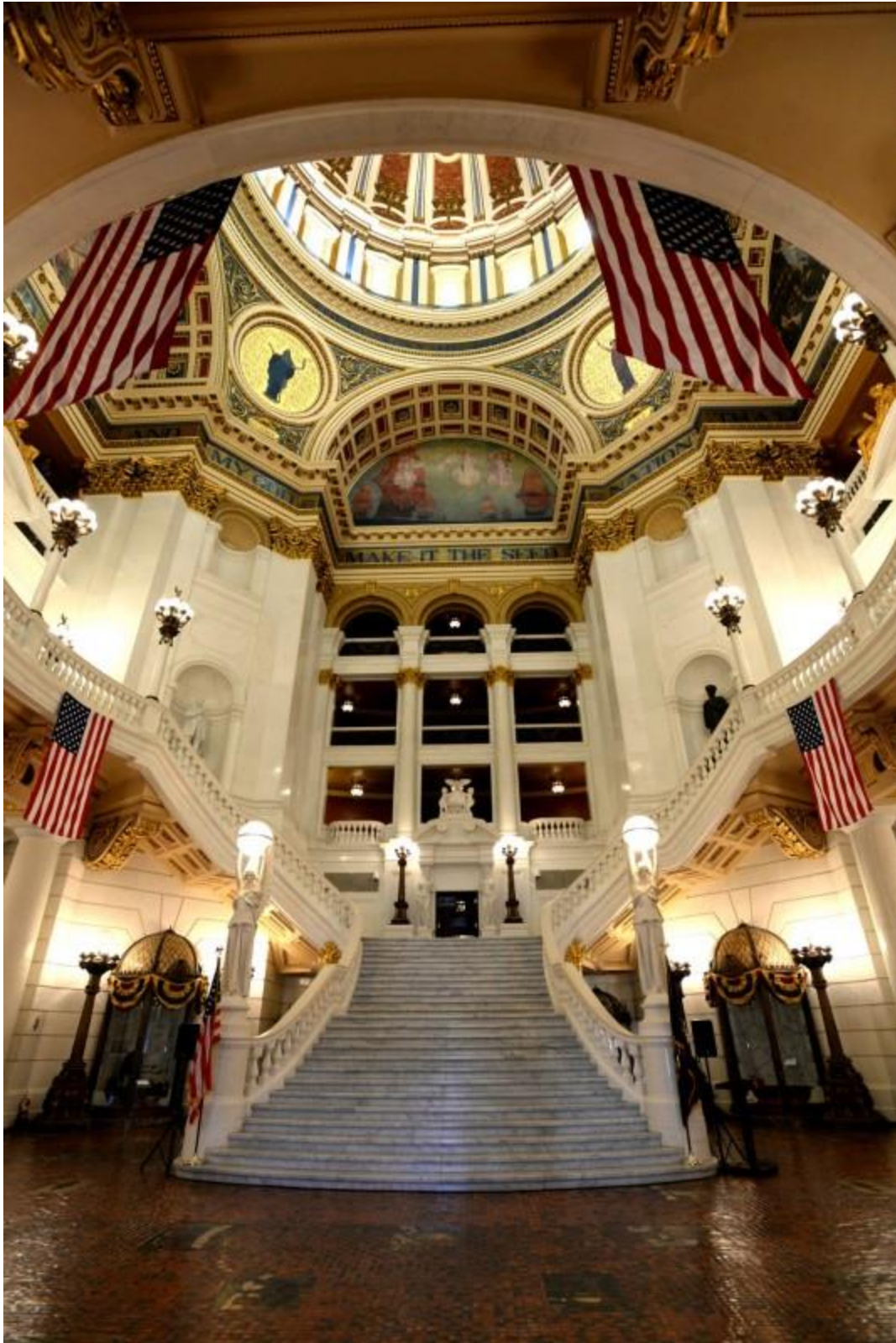
Pennsylvania State Capitol in Harrisburg

The architecture is simply stunning and I highly recommend the free, 1-hour guided tour that provides plenty of interesting history about the state, its politics, and the building in particular.