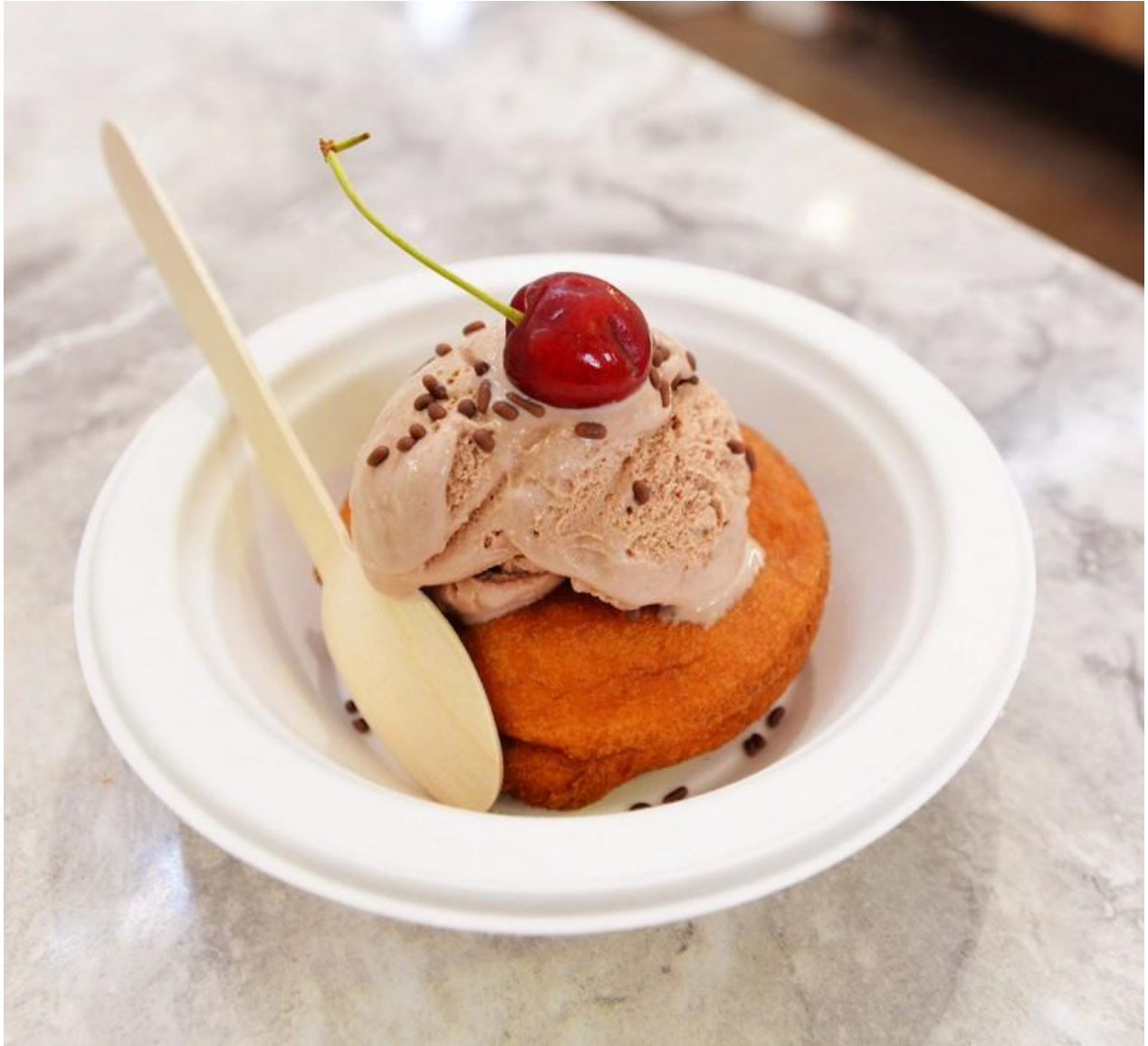
Urban Churn Donut Sundae at Evanilla, Broad Street Market

When you've almost had your fill, grab a donut sundae (how great is it that we live in a world where this exists?!) at the newly opened (as of June 2015) Evanilla . The dessert includes a freshly made donut (plain, cinnamon sugar, powdered, etc.) with a scoop of the locally legendary chocolate or vanilla Urban Churn ice cream . Top it off with sprinkles, whipped cream, a cherry and you're good to go.