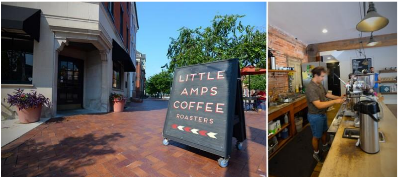
Little Amp Coffee Roasters in Harrisburg, PA

Not surprisingly, locals are pretty dedicated to their particular coffee shop. At least half of downtown Harrisburgers (I’m pretty sure that’s what locals are called ... or at least they should be) love Little Amp Roasters . The place is a little bit hipster, but the smooth, out-of-this-world good coffee will make sure you don’t mind much. Tip: the Cold Jar (espresso shaken with ice and brown sugar, topped with milk, served in a mason jar) is where it’s at.