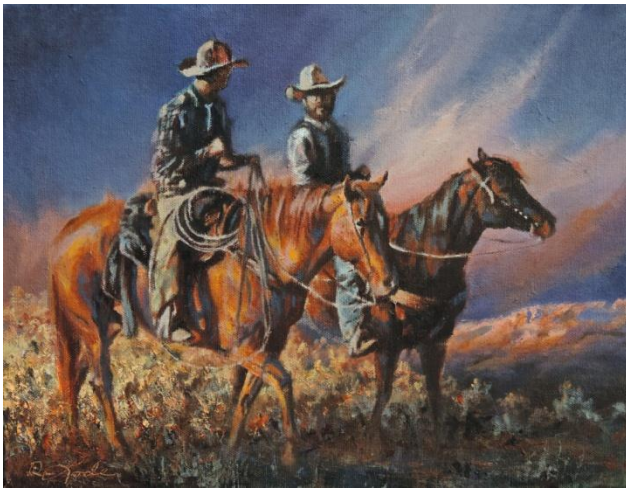
“Long Trails and Tall Tales”