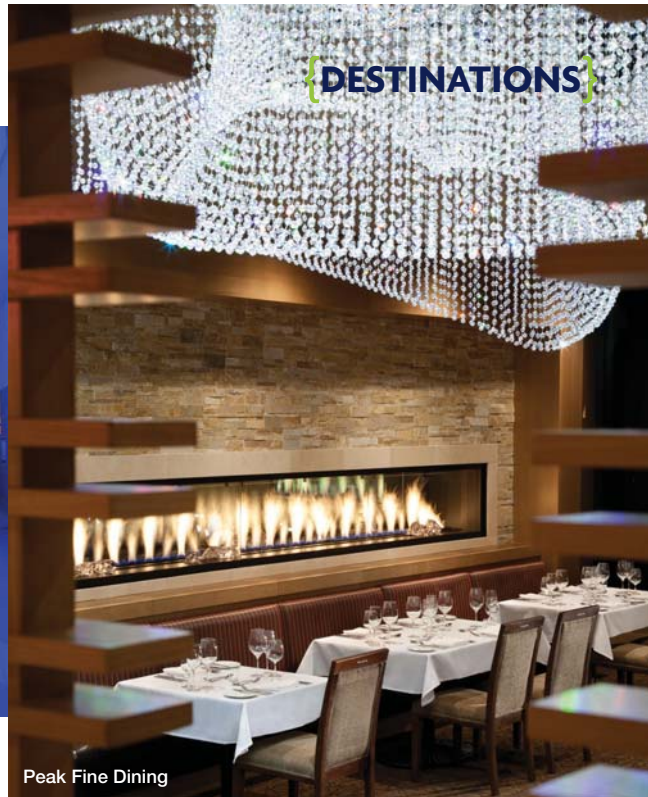
Peak Fine Dining

To work off those calories, guests have access to a state-of-