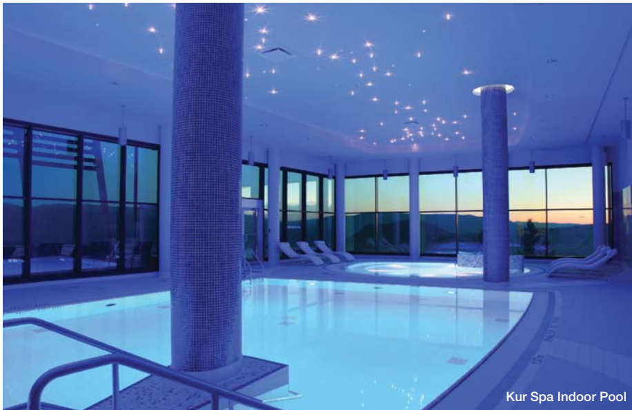
Kur Spa Indoor Pool

heated indoor whirlpool, masterfully designed with powerful jets that deliver a nonstop massage to legs and torso; the indoor pool with its underwater music system and starry crystal adorned ceiling; and the outdoor infinity pool with its phenomenal views of the lake.