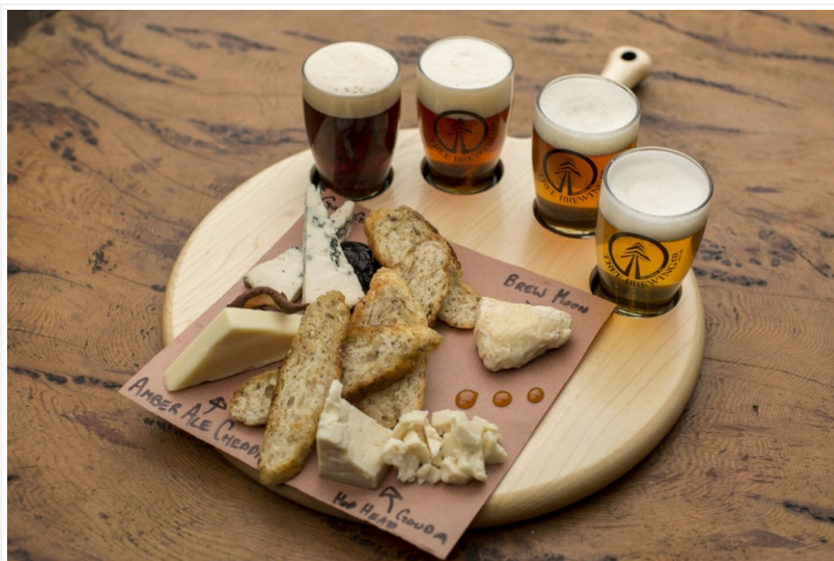
A flight and some nibbles at Tree Brewing.

directly unfiltered, and completely “tank to tap,” and you can enjoy a flight of four in its tasting room. Bowing to the nature theme, you can “pull up a stump” at the bar for a bite to eat too.