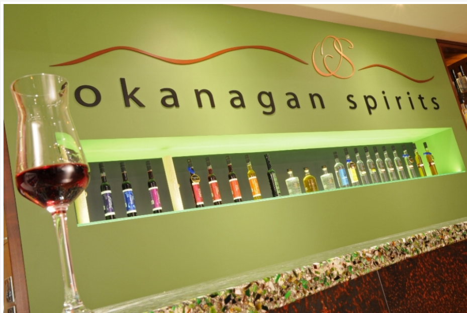
Okanagan Spirits tasting bar

The last call on the tour is Urban Distilleries , Kelowna's first craft artisan distillery, where everything used to ferment is "farm to glass": grown right here in B.C. That means gin flavoured with Kelowna-grown lavender and apple, and each batch is hand-crafted using mountain water.