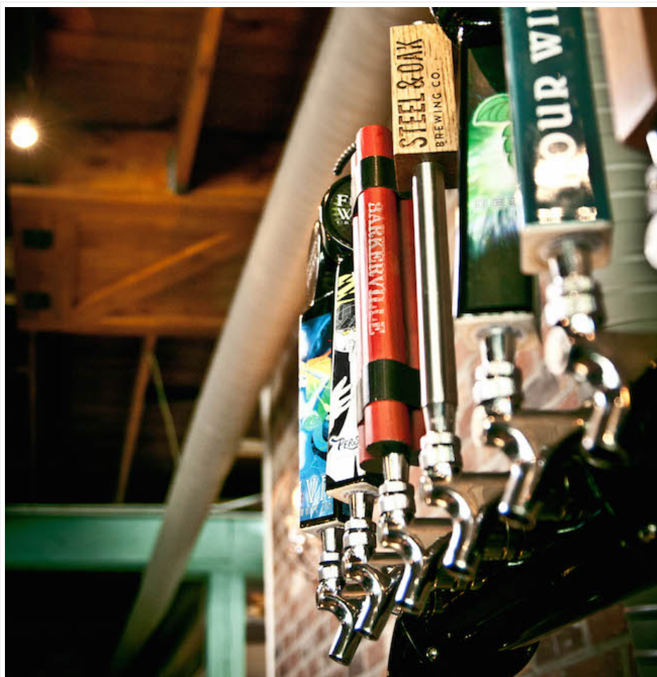
Rotating taps at The Curious Cafe (Jonny Healy).

The 240-seat brewery will feature four BNA beers, with the other eight guest taps rotating through handpicked B.C. craft brews. Oh, and there’s an indoor bocce court, if you needed more reason to stop by.