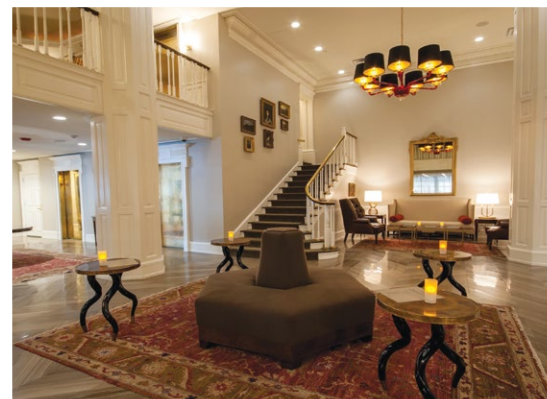
Lancaster Hotel lobby