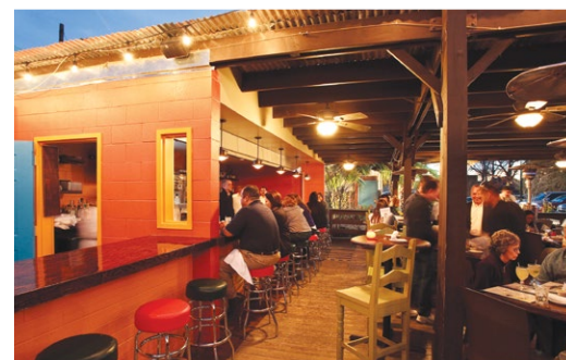
The Original Ninfa's on Navigation