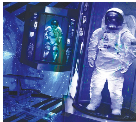
Space Center Houston

During the day, be sure to explore the newly renovated Buffalo Bayou Park , a 160-acre, 2.3-mile-long green oasis in the city where you can walk, rent bicycles or kayak on Buffalo Bayou. Football fans will want to tour NRG Stadium , the first stadium in the NFL to have a retractable roof and a removable natural grass field. In the evenings, see a show, or two, or three. Houston is one of few cities in the country with its own symphony as well as resident companies in ballet, opera, dramatic theater (Alley Theatre) and musical theater (Theatre Under the Stars).