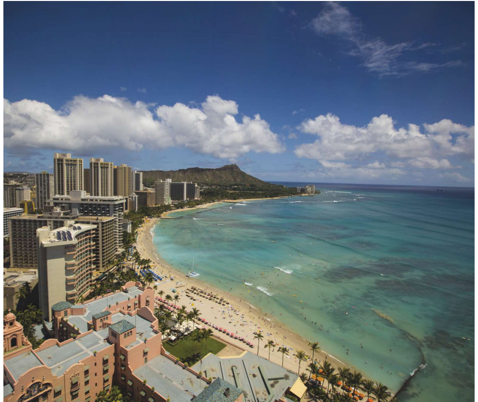
Honolulu beachfront properties offer a variety of meeting venues.