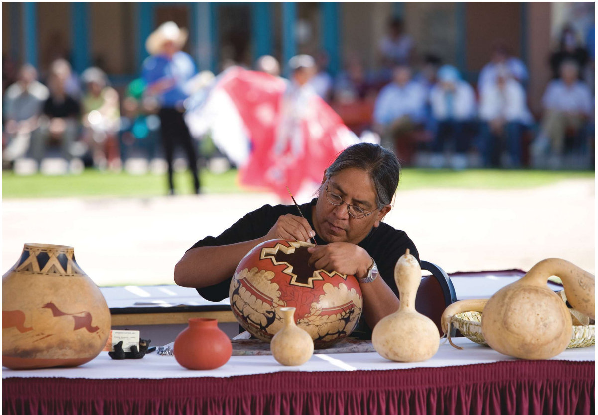
An artist demonstrates traditional crafts at Albuquerque’s Indian Pueblo Cultural Center.