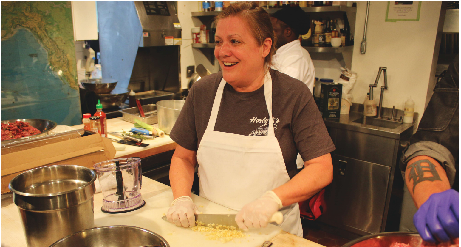
Local Shreveport chefs help meeting groups experience the flavors of Louisiana.