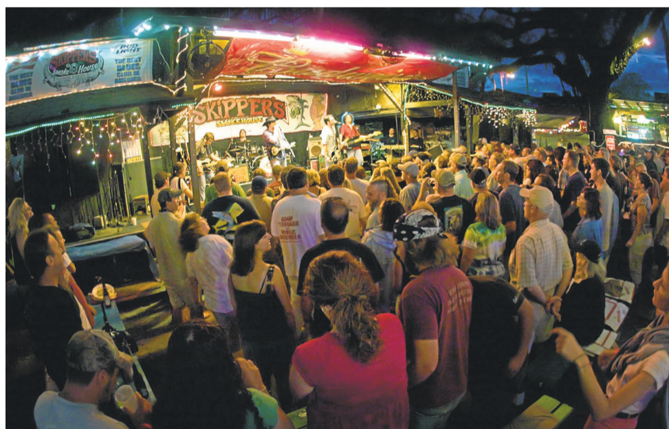
VISIT TAMPA BAY

The Epicurean Hotel (1207 S. Howard Ave.) in the Hyde Park district of South Tampa worships food, from its wine-inspired lobby desk to its in-room artisan pantries. Élevage restaurant, the Chocolate Pi patisserie, wine shop and food and wine-themed spa are placed to attract locals as well as guests. You might luck into a cooking class in the 40-seat Epicurean Theatre. The boutique hotel boasts an in-house TV channel, restaurant "lettuce wall" and cruiser bikes you can borrow.