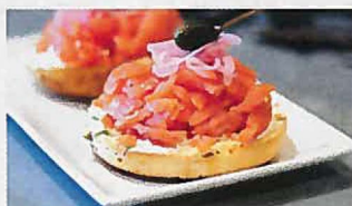
◀ Smoked salmon bagel at Oxford Exchange