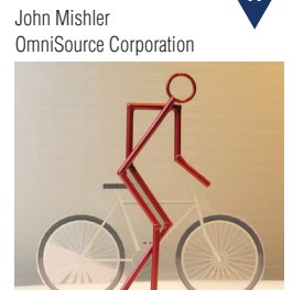
Fort Wayne Parks & Recreation