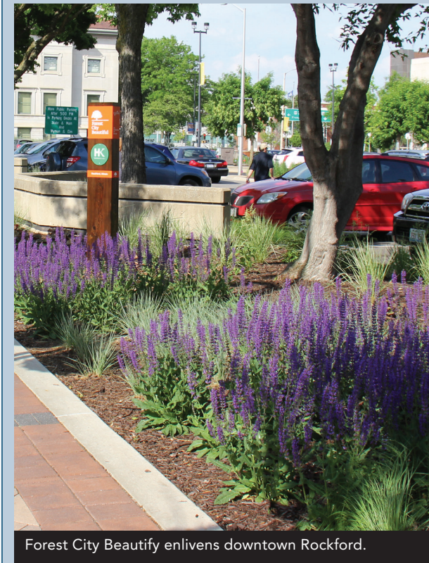
Forest City Beautify enlivens downtown Rockford.