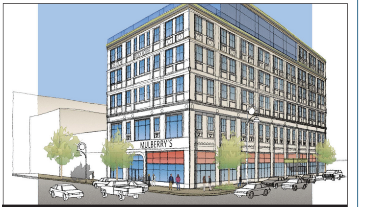
A rendering of the proposed 76-room boutique hotel.