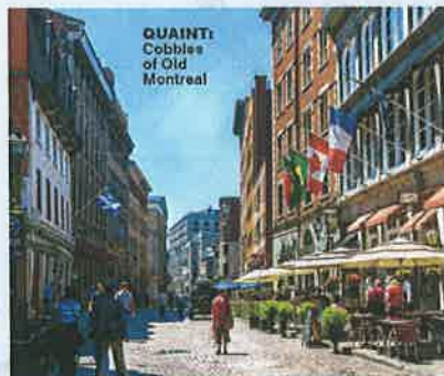
QUAINT: Cobblestones of Old Montreal

I hadn't been to Montreal for more than 30 years. I'd always wanted to go back but, to paraphrase John Lennon, life got in the way.