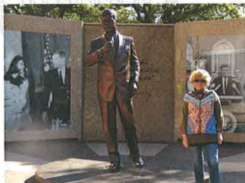
HERO: The tribute park to JFK who spent his last night alive in Fort Worth

separated dining area that used to segregate the races. Taking a bite from his 'delicious' local speciality rabbit and rattlesnake