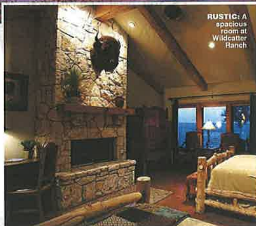
RUSTIC: A spacious room at Wildcatter Ranch

A modern-day pioneer, Ann Street Skipper created Wildcatter (the oil term for those who take a chance and drill without knowing what might be down there) a working ranch hotel resort and spa overlooking the Brazos River from virgin territory. The last Indian