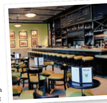
The Bird Café