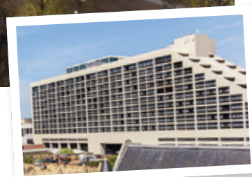
The Worthington Renaissance Hotel