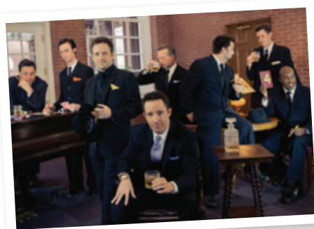
Four Day Weekend

Milan is also the exclusive American gallery for authentic Michelangelo bronze sculptures.