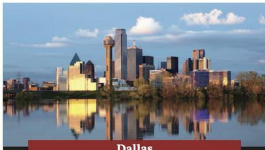
Dallas Population: 1,257,676

They may be siblings, but these Texas towns couldn't be more different. Here's how they stack up