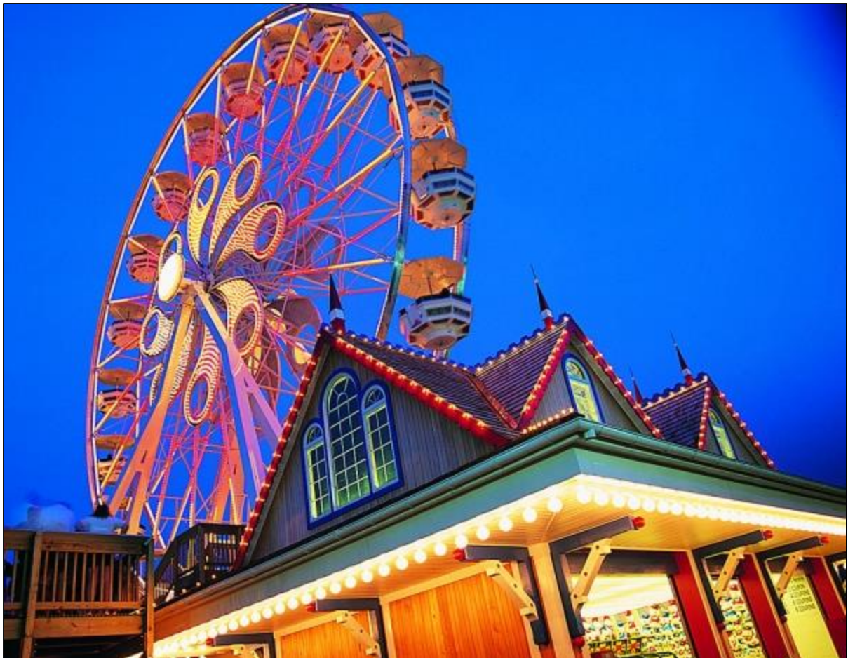
Take a spin on the Ferris wheel at Hersheypark.

A top tourist destination of the state, the two cities offer a host of activities, from theme parks to museums and even a minor league baseball stadium nearby. What makes it an ideal destination to host a meeting or event is not only all the fun, but the charming meeting and event accommodations throughout the area.