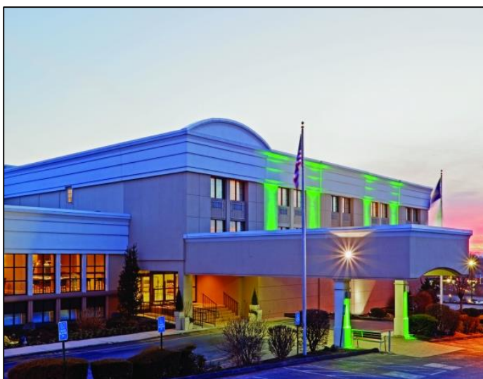
The Red Lion Hotel is convenience personified.