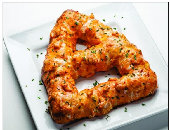
Arooga's crab pretzel is a delicious treat.

Arooga's Grille House & Sports Bar is widely known for its award-winning wings and wall-to-wall large screen TVs, however, it also boasts a diverse menu featuring its famous Arooga's Crab Pretzel, Wagyu Kobe Burgers, all-natural soups and dips and a huge draft selection featuring many craft beers and handcrafted cocktails. Out of the three Arooga's locations in Harrisburg, two offer private dining rooms: The Route 22 Allentown Boulevard location's private room can accommodate approximately 30-40, while the Route 39 Linglestown Rd. location's private room can fit 30. Although there's no private room in the downtown location on North 2nd Street, it's still equipped to accommodate large groups.