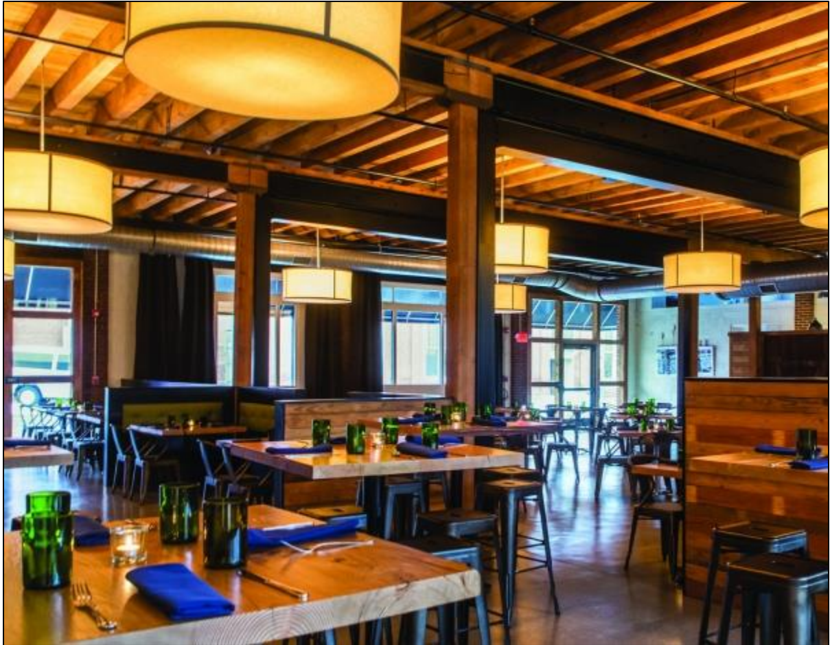
The Millworks industrial-chic interiors are inviting

“Building relationships with our growers, and being next to the oldest farmer’s market in the country, the Millworks will be working to create a sustainable food network, connecting local farms to the city,” Garrity says. “It is a unique experience. The Millworks is more than just a restaurant, it is a destination for great local and sustainable food, beautiful art, friendly and talented local artists, great beers, ciders, and spirits and a live music venue as well.” The Millworks has private event space that seats up to 40 guests.