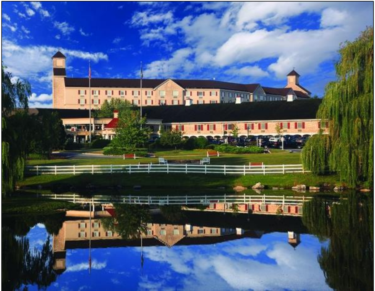
The Hershey Lodge is a welcoming home for meeting attendees.