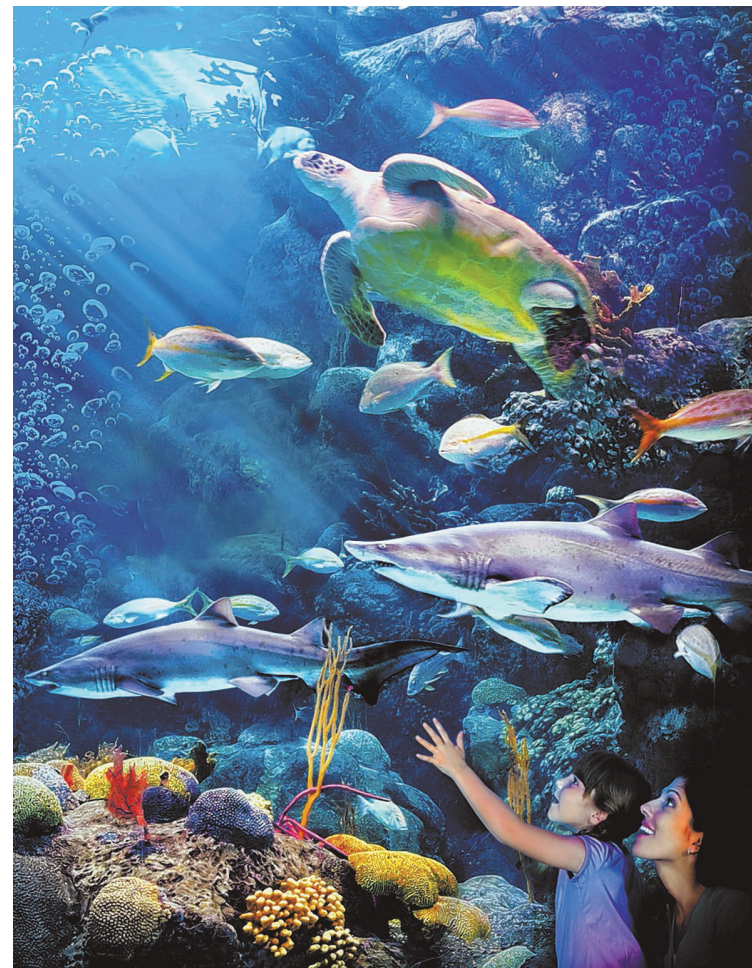
PHOTOS COURTESY OF VISIT TAMPA UNDER THE SEA: The Florida Aquarium hosts a variety of undersea creatures, above. A Riverwalk canopy, above left, is lit at sunset.