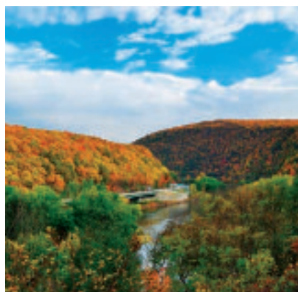
Left to right: King of Prussia Mall; Valley Forge; Rocky Statue, Philadelphia Museum of Art; Philly cloaked in summer blooms; The stunning Pocono Mountains are an adventure playground of numerous activities lakes and quaint