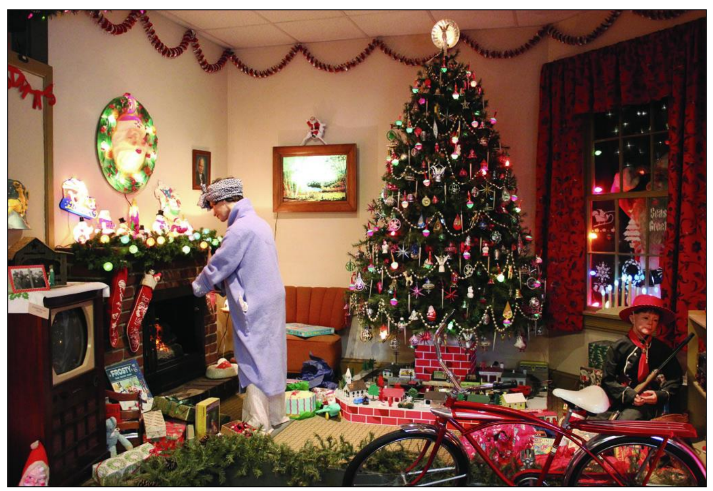
(Media has no rights to use photo displayed in this document. It was pulled from Google Images for use only as visual representation of event/activity outlined above. Contact attraction directly to request images.)

May 2016 – Jan. 8, 2017 - Part museum, part time machine – 15 main galleries and numerous small exhibits at this attraction take visitors back through the ages of Christmas from the past to present and from America's hometown traditions to the holiday customs of faraway lands. This unique experience includes 20,000 square-feet of life-sized walk-through indoor exhibits appropriate for all ages including a 1950 Christmas Morning living room set, Christmas Around the World, Santa's Workshop, Vintage Christmas, Images of Santa, and Toyland Train Mountain. Located in Paradise, PA about 50 miles southeast of Harrisburg, PA. Season hours of operation. Open daily from 10am-6pm from May 2016 thru Jan. 8, 2017. Closed Thanksgiving Day, Christmas Day, and New Year's Day. Open 10am-3pm Christmas Eve and New Year's Eve. Get more details on this attraction at www.nationalchristmascenter.com. Media can contact Heidi Brennan, Museum & Marketing Director at 717-442-7950 or heidi@nationalchristmascenter.com.