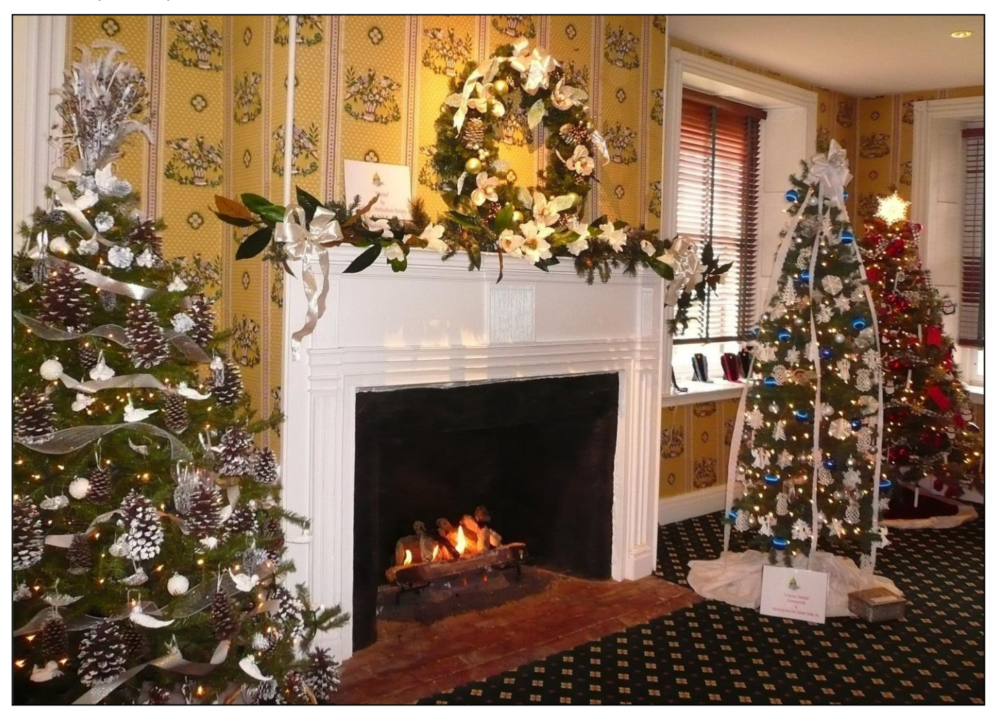
(Media has no rights to use photo displayed in this document. It was pulled from the attraction's web site for use only as visual representation of event/activity outlined above. Contact attraction directly to request images.)

Nov. 26–Dec. 18 – Sat & Sun only – This free event features eight themed Christmas trees decorated with handmade ornaments and trimmed by local garden clubs on exhibit at the Tavern House every Saturday & Sunday from 12:30pm-4:30pm between Nov. 26 and Dec. 18, 2016.