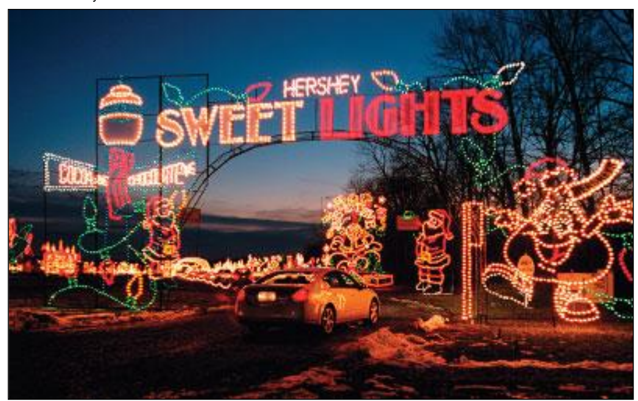
(Media has no rights to use photo displayed in this document. It was pulled from Google Images for use only as visual representation of event/activity outlined above. Contact attraction directly to request images.)

Select Dates Nov. 11 thru Jan. 1, 2017 - A 2-mile drive-thru light display in Hershey, PA featuring nearly 600 illuminated, animated displays tucked along a trail that winds through fields and wooded areas behind The Hotel Hershey. Get more details on this attraction at www.hersheypark.com/seasons/sweet-lights.php. Media can contact Kathy Burrows, PR Manager at Hershey Entertainment & Resorts Company at (cell) 717-571-5356 or email KBurrows@HersheyPA.com.