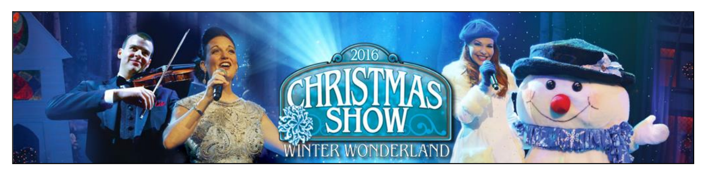
(Media has no rights to use photo displayed in this document. It was pulled from the attraction's web site for use only as visual representation of event/activity outlined above. Contact attraction directly to request images.)

Nov. 1 thru Dec. 30, 2016 - This holiday season, join our Yuletide tradition with AMT's 2016 Christmas Show: Winter Wonderland and recapture the Christmas spirit. Step through the doors of this beautiful modern theatre and be transported to a wonderland of music and enchantment – from a Bavarian mountain village to the festive, holiday excitement at the North Pole. Winter Wonderland features the secular and sacred holiday songs you know and love, with all-live performances by our sensational cast of Singers and Dancers, as well as the remarkable 9-piece AMT Orchestra. Performances November 1 – December 30, 2016. Contact Donna Haefner, 800-648-4102 X6202, dhaefner@AMTshows.com, www.AMTshows.com.