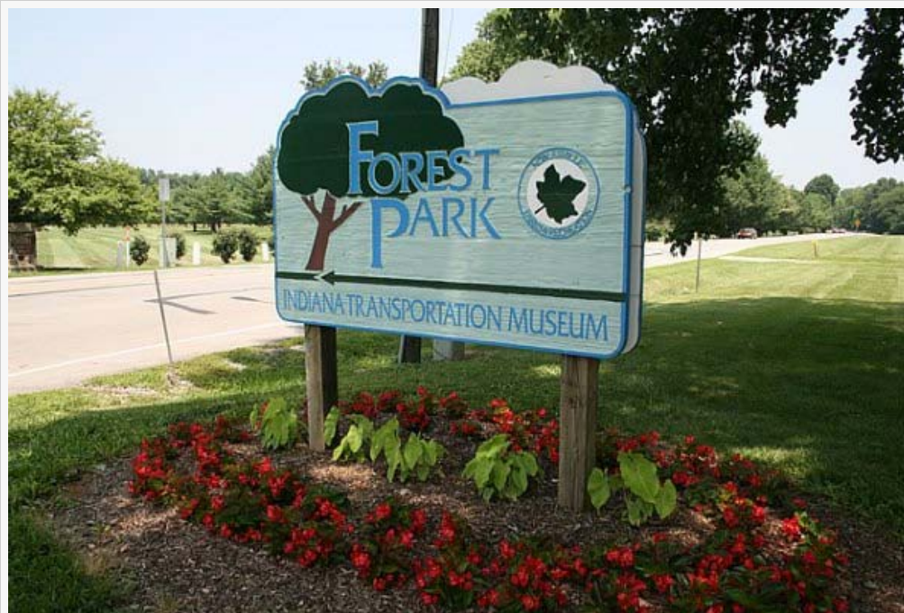
Forest Park, Noblesville, Indiana. AroundIndy.com staff photo.

September 11, 2011 aroundindy Go to comments Leave a comment