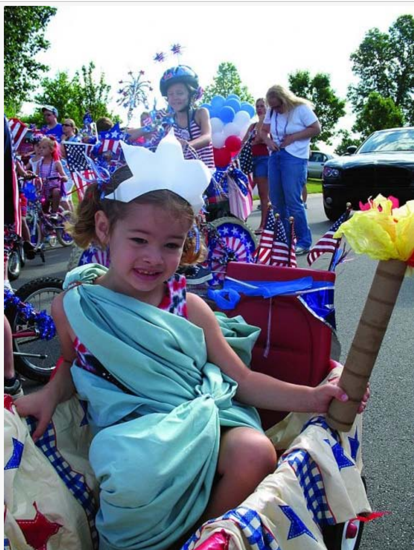
ABOVE: "Miss Liberty" at the children's parade at the Fishers Freedom Festival.