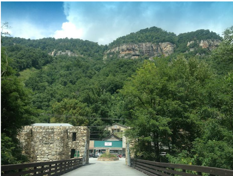
Chimney Rock Village