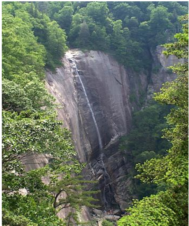
Hickory Nut Falls

Hickory Nut Falls Trail winds through Hickory Nut Gorge to the bottom of Hickory Nut Falls. The second highest falls of its kind east of the Mississippi River, the falls played a major role in “The Last of the Mohicans,” the 1992 movie starring Daniel Day-Lewis.