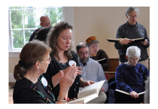
Shape-note a cappella singers from across the nation flock to <u>Old St. John's Church</u> in Rutherfordton each December.

On the Saturday before Thanksgiving, attend the <u>Ellenboro Fiddlers'</u> <u>Convention</u> at the Ellenboro School Auditorium. The Ellenboro gathering is a direct descendent of the Hollis Fiddlers Convention, held nearby for decades. The Hollis gatherings in the 1930s witnessed the advent of three-finger banjo picking among area textile workers that eventually gave rise to the bluegrass music you know today.