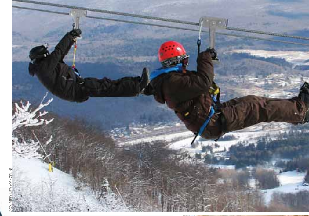
Above: New York Zipline at Hunter Mountain

See new productions of Broadway's The Addams Family (12/6-11) and Les Miserables (2/28-3/4) at Shea's in Buffalo's Theater District. 716/847-1410; sheas.org