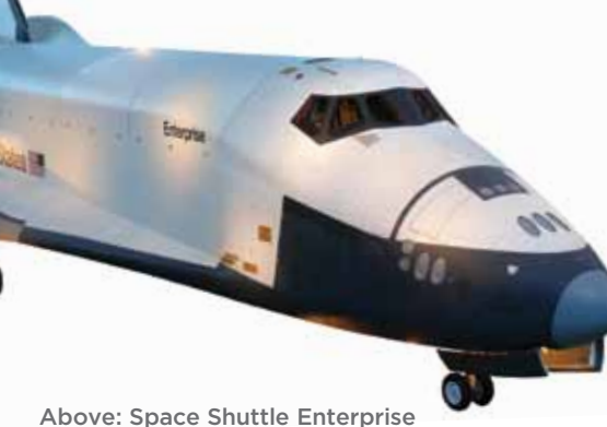
At right: Intrepid Sea, Air & Space Museum