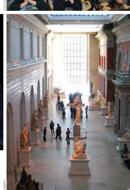
iloveny.com · 3 · WINTER