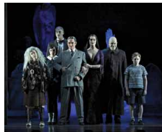
Above: The Addams Family At right: The Metropolitan Museum of Art