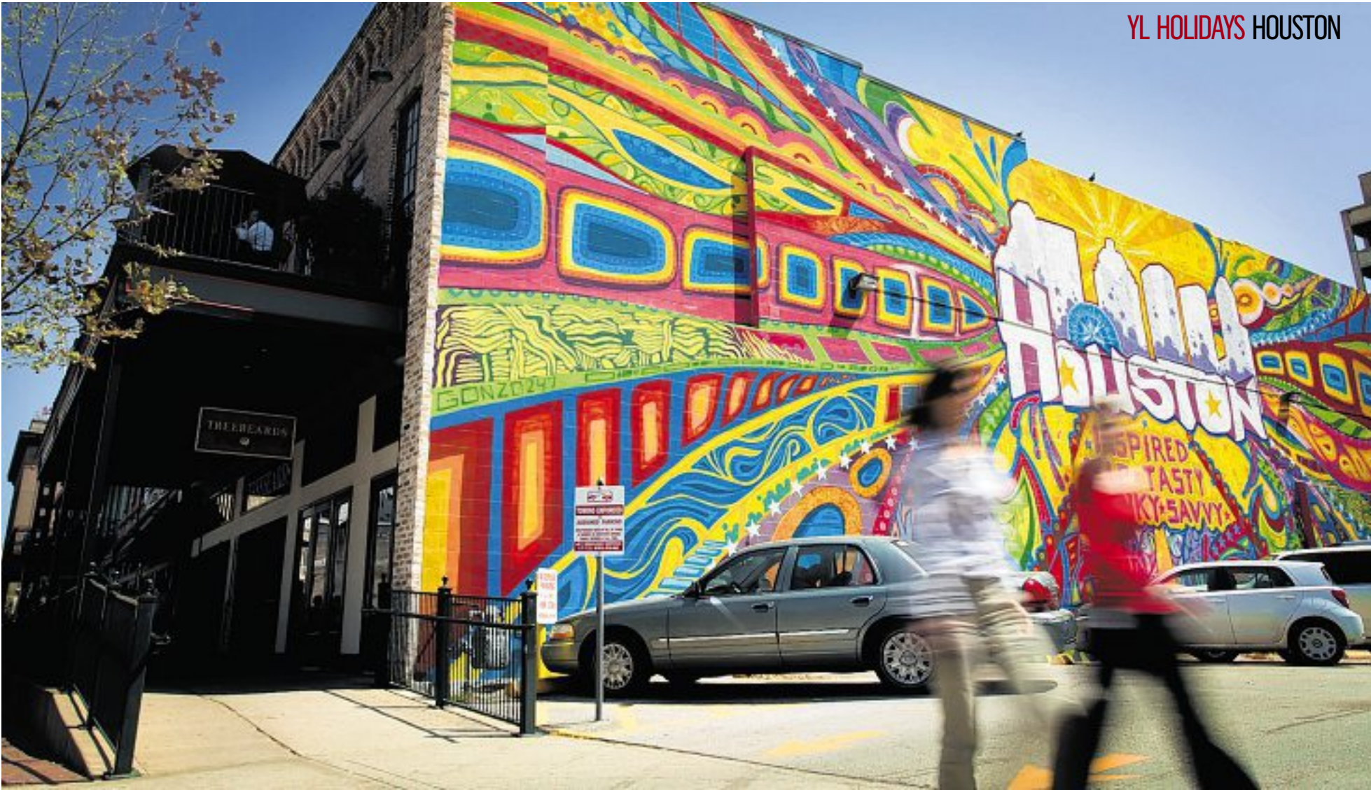
YL HOLIDAYS HOUSTON