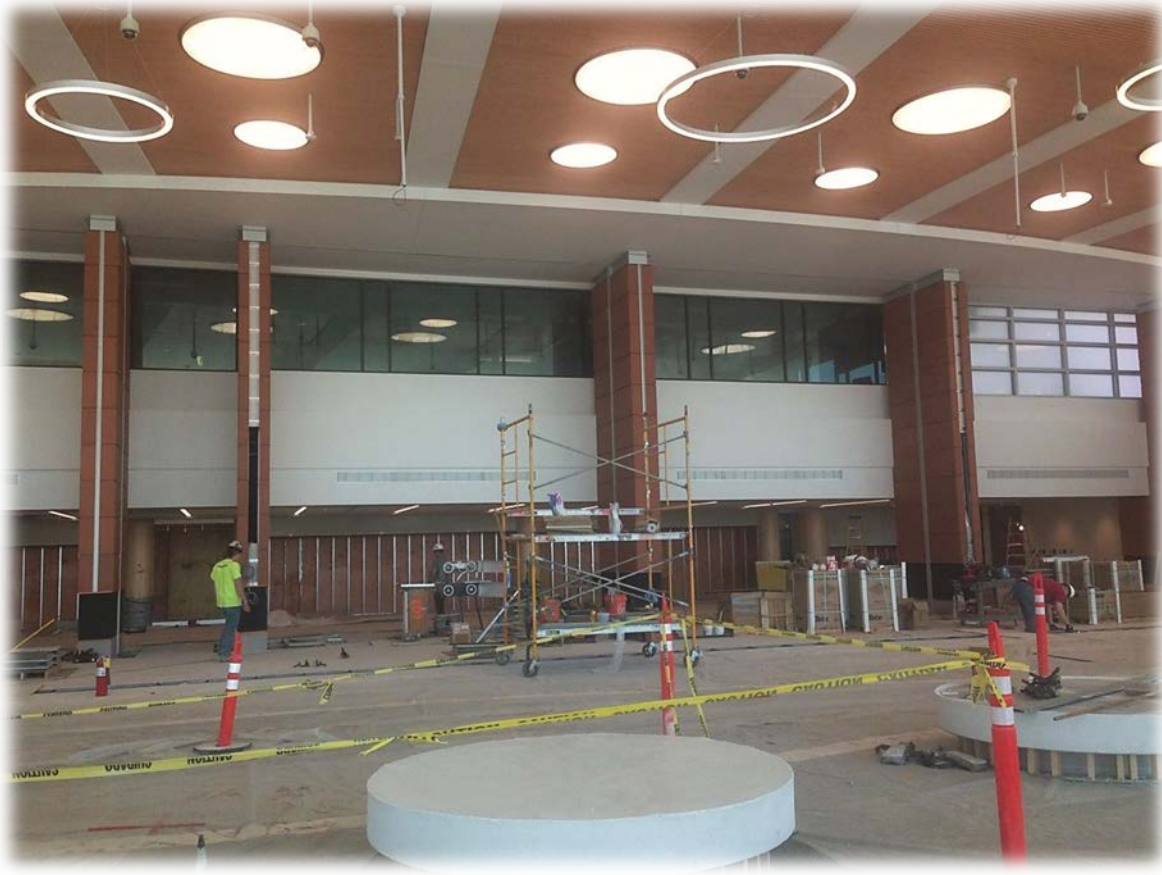
(Above): Construction crews work on the front entrance of the Gateway Transformation Project at the consolidated security checkpoint.

Grand Rapids, Mich. –Passengers traveling through the Gerald R. Ford International Airport (GFIA) this weekend will notice a change in security screening as one part of its Gateway Transformation Project transitions.