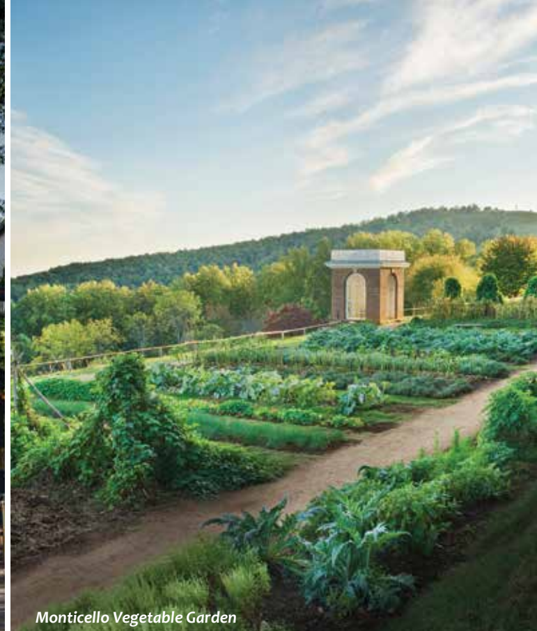
Monticello Vegetable Garden