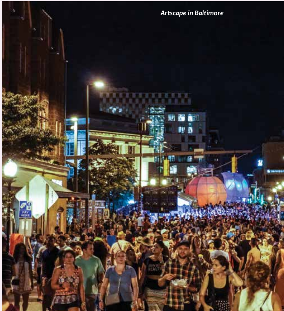
Artscape in Baltimore

3200 Mount Vernon Memorial Highway Mount Vernon, Virginia