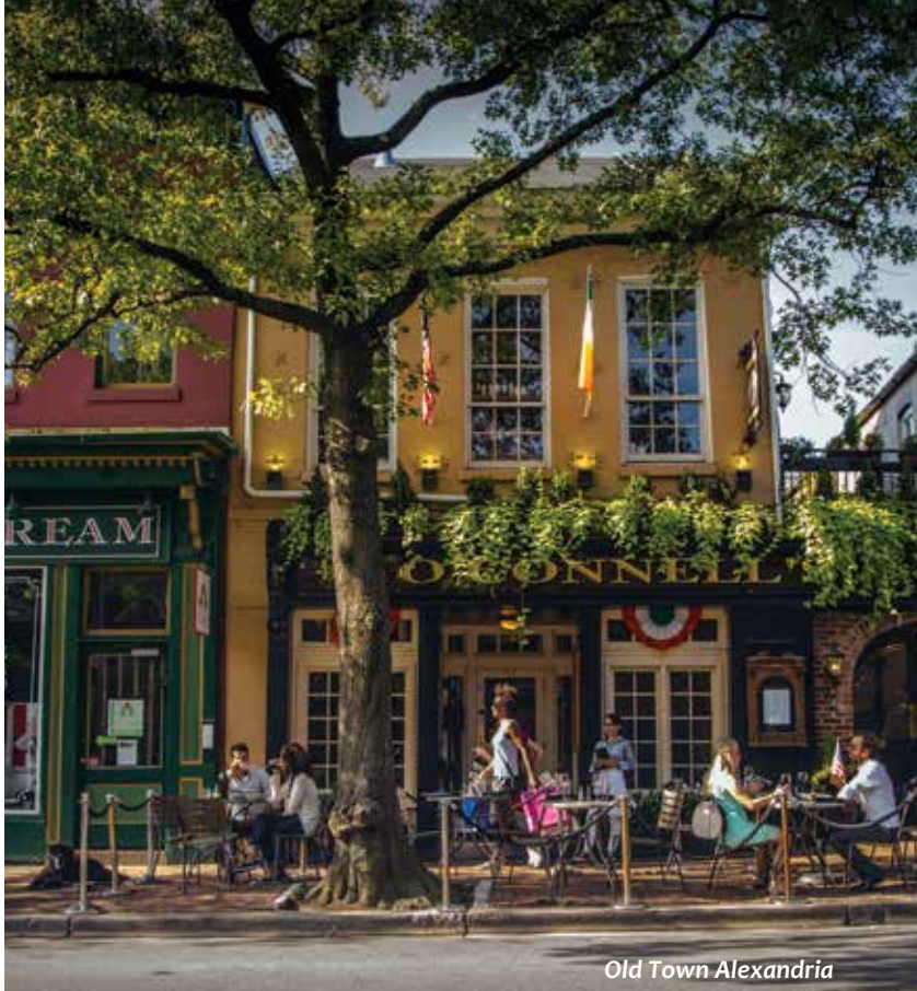
Old Town Alexandria