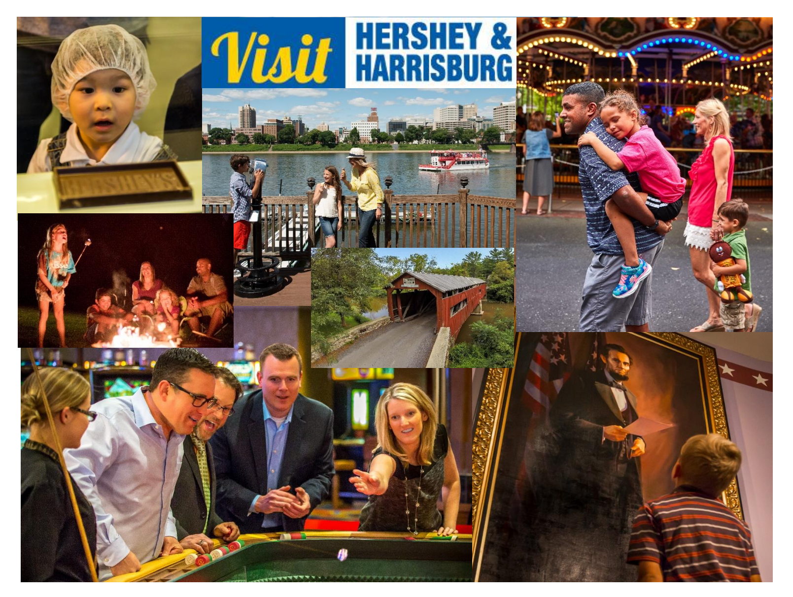
STORY IDEAS - FALL 2017