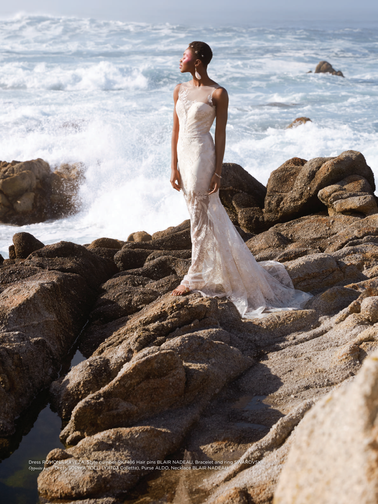
Dress ROMONA KAVEZA, Style number RK7486 Hair pins BLAIR NADEAU, Bracelet and ring SWAROVSKI Opposite page: Dress SOPHIA TOLLI (Y11703 Collette), Purse ALDO, Necklace BLAIR NADEAU