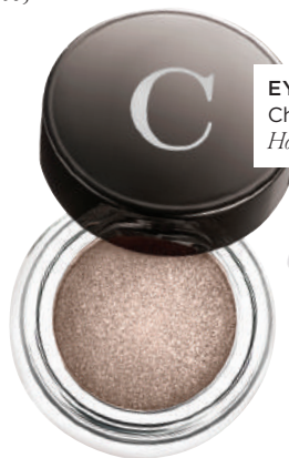
EYE COLOUR Chantecaille, $46 Holt Renfrew