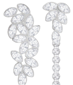
EARRINGS Swarovski, $149