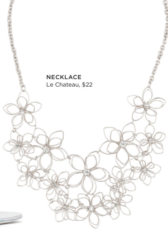
NECKLACE Le Chateau, $22