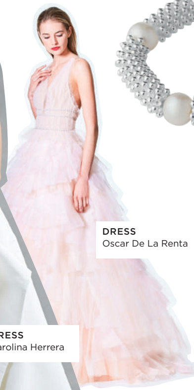
DRESS Oscar De La Renta