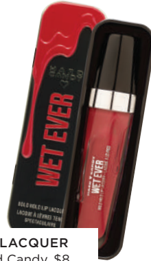
LIP LACQUER Hard Candy, $8 Walmart