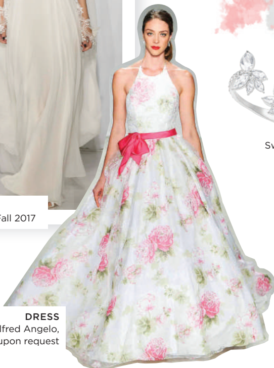
DRESS Alfred Angelo, Price upon request