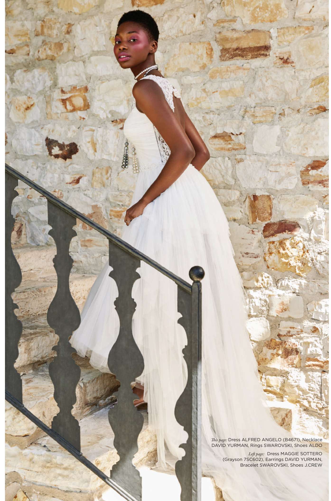
This page: Dress ALFRED ANGELO (B4671), Necklace DAVID YURMAN, Rings SWAROVSKI, Shoes ALDO Left page: Dress MAGGIE SOTTERO (Grayson 75C602), Earrings DAVID YURMAN, Bracelet SWAROVSKI, Shoes J.CREW