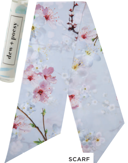
SCARF Ted Baker, $85