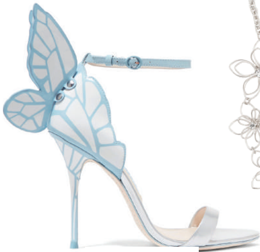
SHOES Sophia Webster, $650 net-a-porter.com