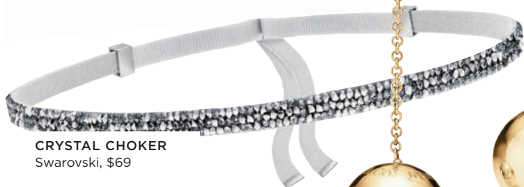
CRYSTAL CHOKER Swarovski, $69