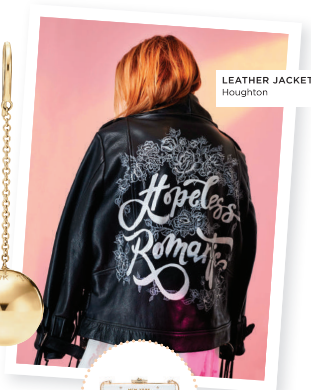
LEATHER JACKET Houghton