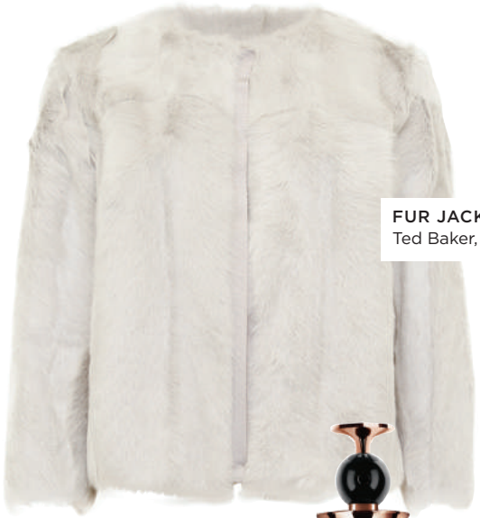
FUR JACKET Ted Baker, $1,135