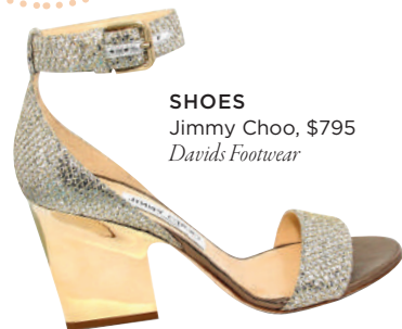
SHOES Jimmy Choo, $795 Davids Footwear

Infuse city style into your bridal look with streamlined silhouettes, graphic accessories, and a handprinted leather jacket.