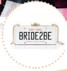
PURSE Kate Spade, $398