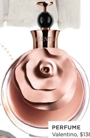
PERFUME Valentino, $138 Holt Renfrew