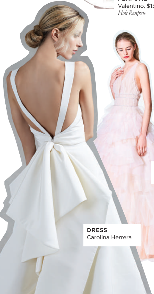
DRESS Carolina Herrera