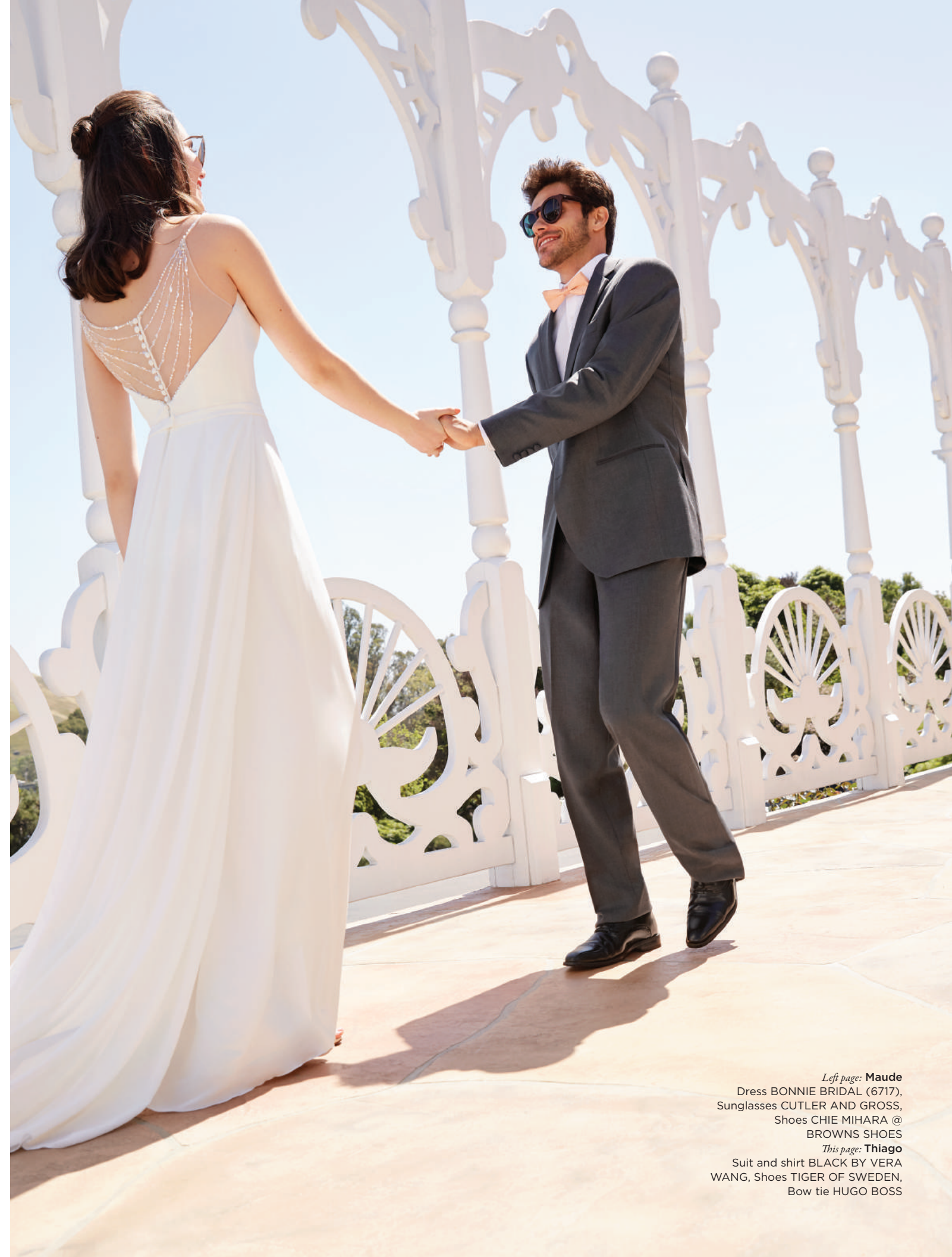
Left page: Maude Dress BONNIE BRIDAL (6717), Sunglasses CUTLER AND GROSS, Shoes CHIE MIHARA @ BROWNS SHOES This page: Thiago Suit and shirt BLACK BY VERA WANG, Shoes TIGER OF SWEDEN, Bow tie HUGO BOSS