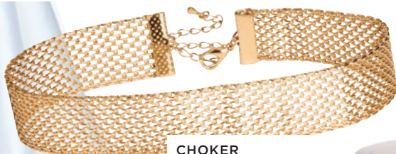
CHOKER H&M, $13