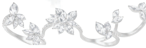
RING Swarovski, $299