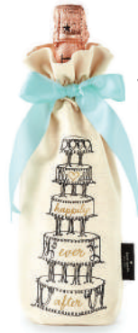
WINE TOTE Kate Spade, $20