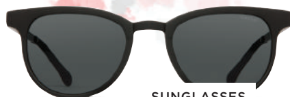
SUNGLASSES Komono, $115