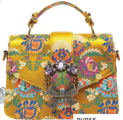
PURSE Aldo, $75