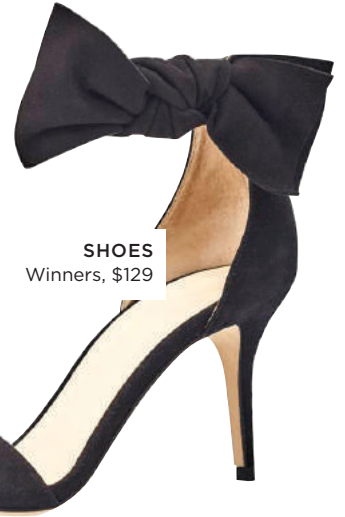
SHOES Winners, $129