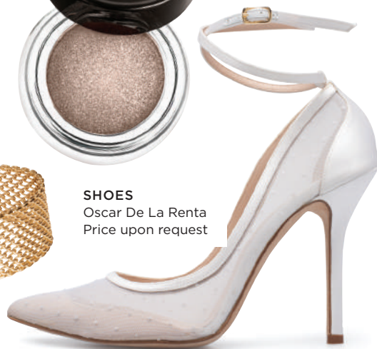
SHOES Oscar De La Renta Price upon request