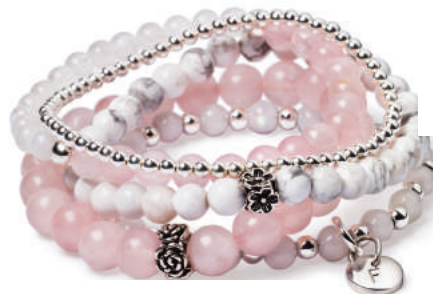
BRACELETS Suetables, $34