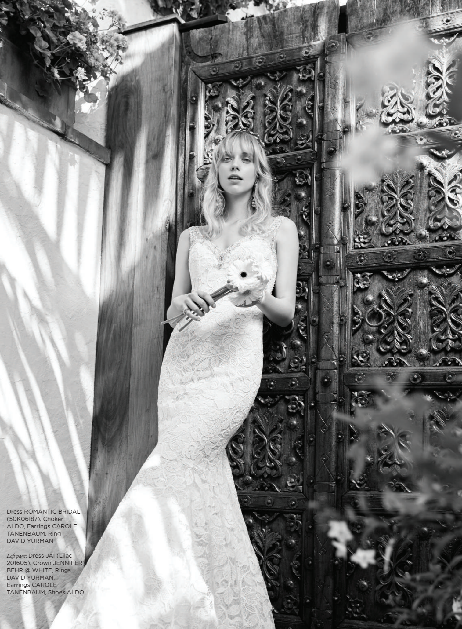
Dress ROMANTIC BRIDAL (50K06187), Choker ALDO, Earrings CAROLE TANENBAUM, Ring DAVID YURMAN