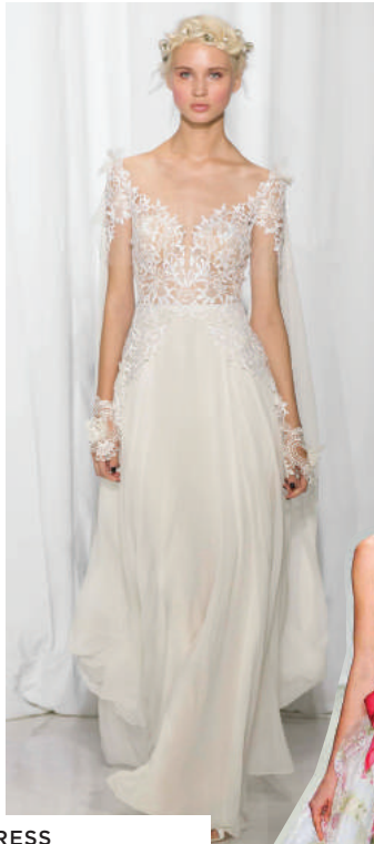
DRESS Reem Acra Fall 2017

Florals make their way into fall with garden inspired prints and 3D floral appliques.