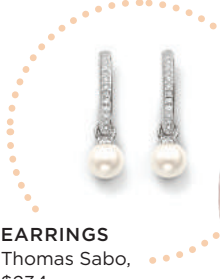
EARRINGS Thomas Sabo, $234

Channel your inner Parisian with bow details, ruffle skirts and pearl embellished accessories.