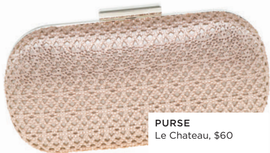
PURSE Le Chateau, $60