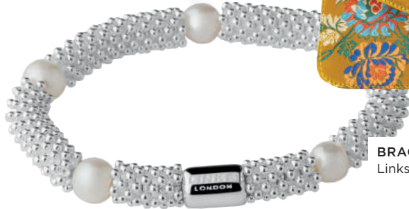
BRACELET Links of London, $495