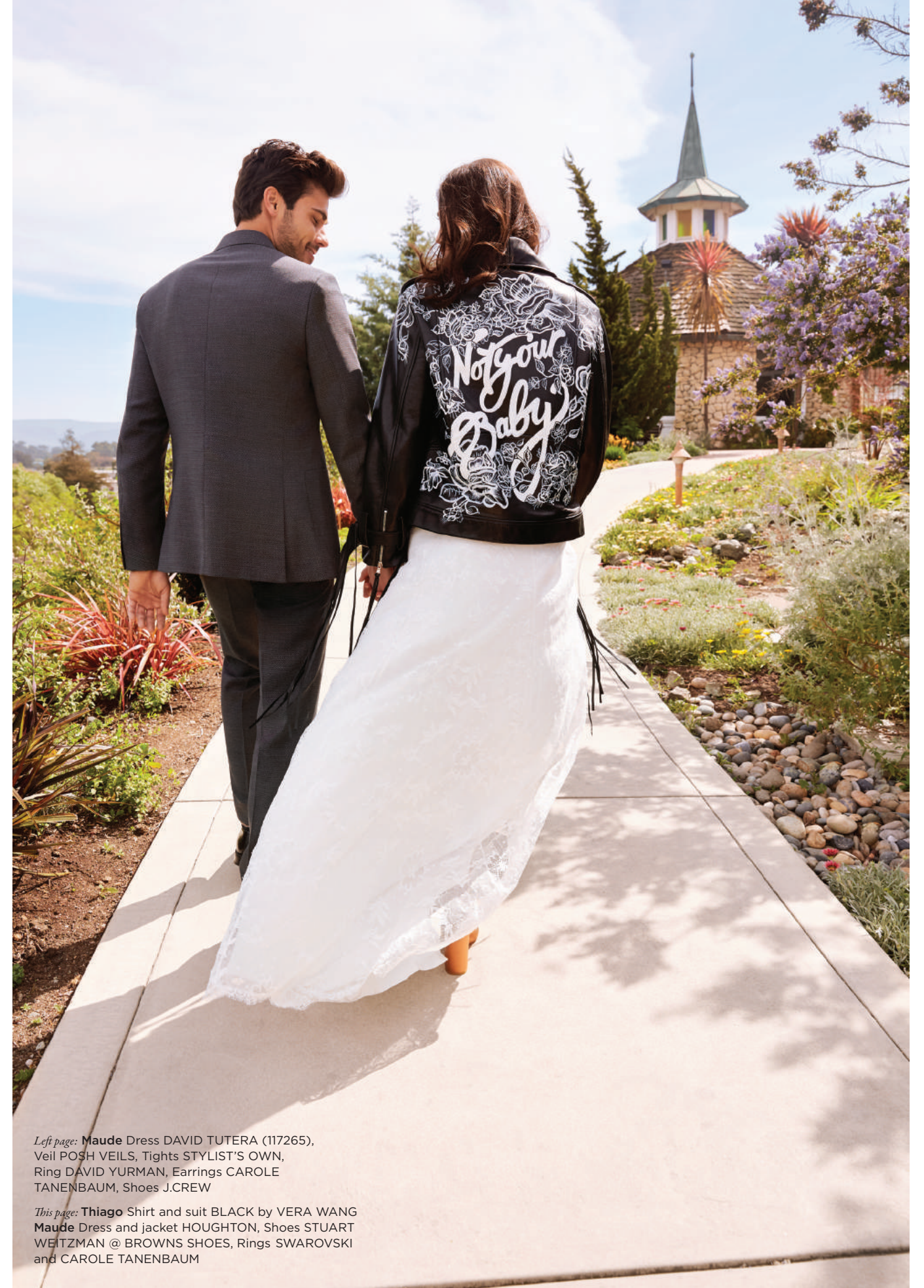
Left page: Maude Dress DAVID TUTERA (117265), Veil POSH VEILS, Tights STYLIST'S OWN, Ring DAVID YURMAN, Earrings CAROLE TANENBAUM, Shoes J.CREW