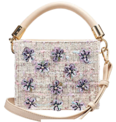
PURSE Marshalls, $30