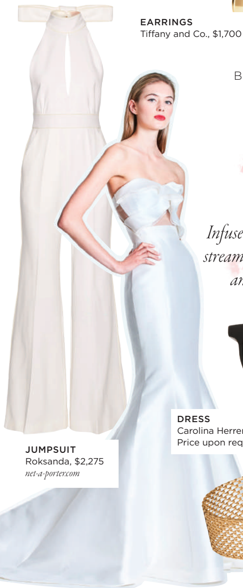
JUMPSUIT Roksanda, $2,275 net-a-porter.com