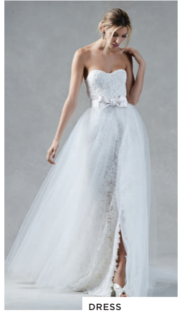
DRESS Oscar De La Renta