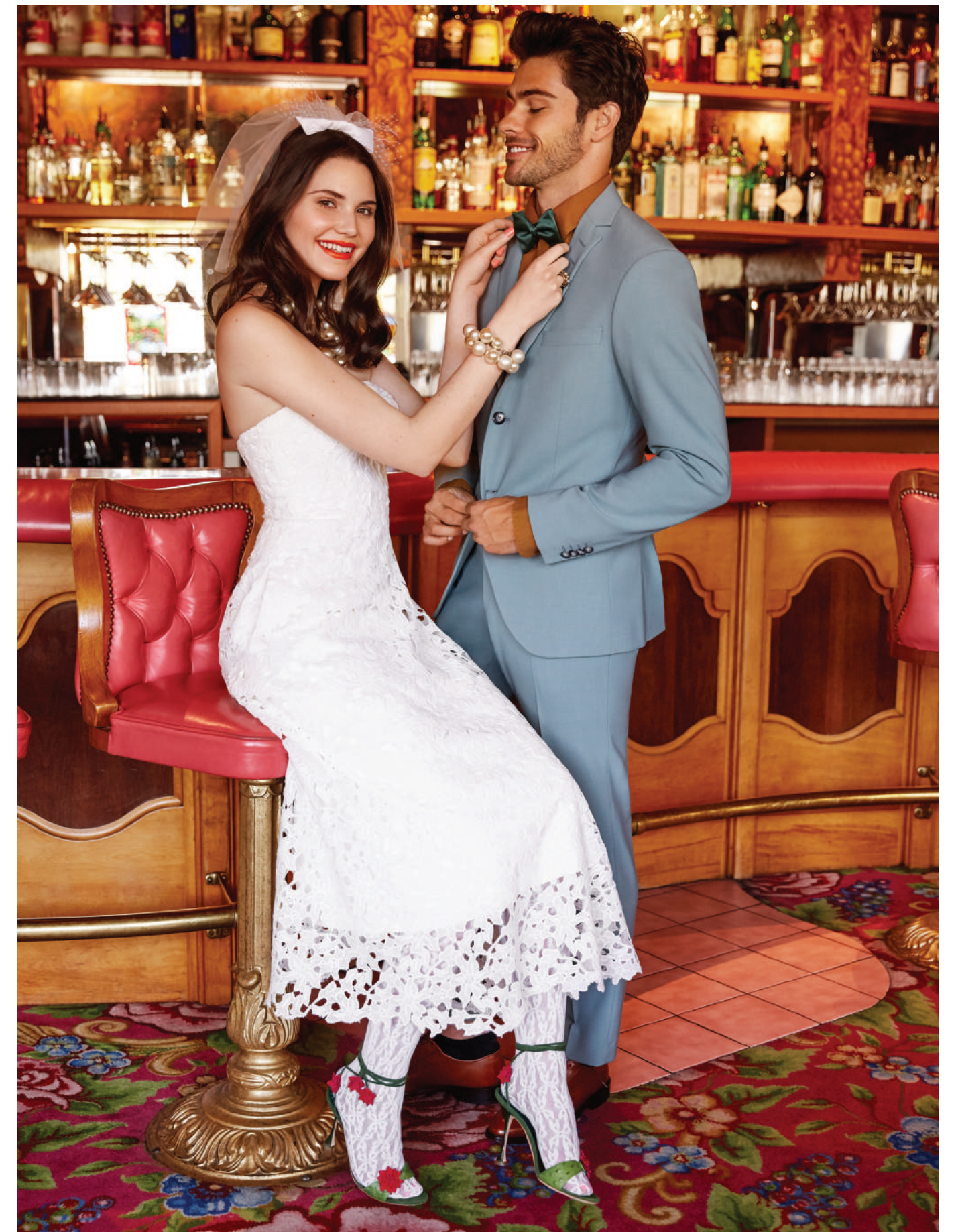
Opposite page: Maude: Dress DAVIDS BRIDAL/GALINA (KP37642VC) Bracelet, necklace, ring CAROLE TANENBAUM, Shoes MANOLO BLAHNIK @ BROWNS SHOES, Veil POSH VEILS, Tights STYLIST'S OWN Thiago Shirt, suit, bow tie and shoes TIGER OF SWEDEN