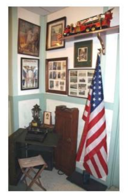
A few of the many displays in several rooms of the original Camp Grant building. Photos, post cards, maps, official documents, military uniforms and gear and popular sheet music of the time on exhibit.

The Command Post Restaurant houses the Camp Grant Museum in an original Camp building that once served as a fire station and later as the induction and muster out center. Camp Grant came into being in the early months of World War I. Construction began June 30, 1917 and in just two months' time, 1,100 buildings were completed. The Camp was named in honor of U.S. Grant on July 15, 1917. By 1918 the Camp housed 50,000 officers and enlisted men and covered 5,460 acres of land.