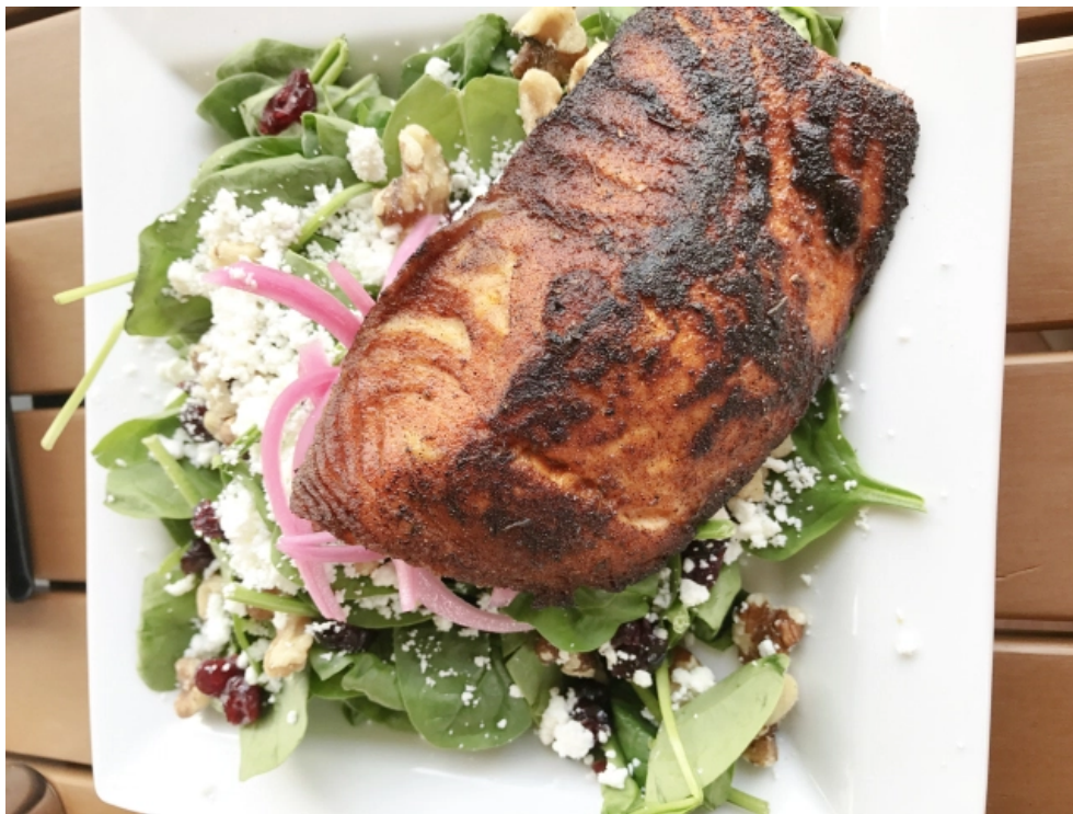
Grilled Faroe Island salmon over a spinach salad at Volare Bistro in Hapeville.

Where to eat in Hartsfield-Jackson: Check out the top restaurants in each concourse, from chains to local favorites including Ecco, Chicken + Beer and One Flew South .