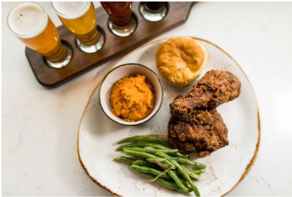
Southern fried chicken with molasses biscuit, braised green beans, and sweet potato mash and a local beer flight at Chicken + Beer. / Photo credit- Mia Yakel.

Where to eat in Hartsfield-Jackson: Check out the top restaurants in each concourse, from chains to local favorites including Ecco, Chicken + Beer and One Flew South .