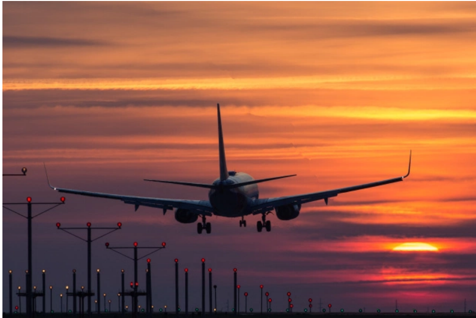
An airplane arrives at Hartsfield-Jackson Atlanta International Airport at sunrise, Thursday, March 24, 2016, in Atlanta.

Updated November 10, 2017 Filed in ALERT , Dining Out , Dining Team , georgia-news.ajc , Restaurants , Restaurants & Dining , South Fulton , sp-holidayguide , spcontent , things-to-do.ajc .