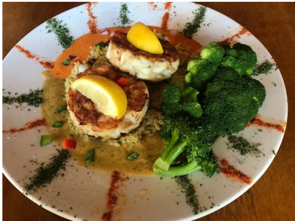
Crabcakes at Spondivits in East Point