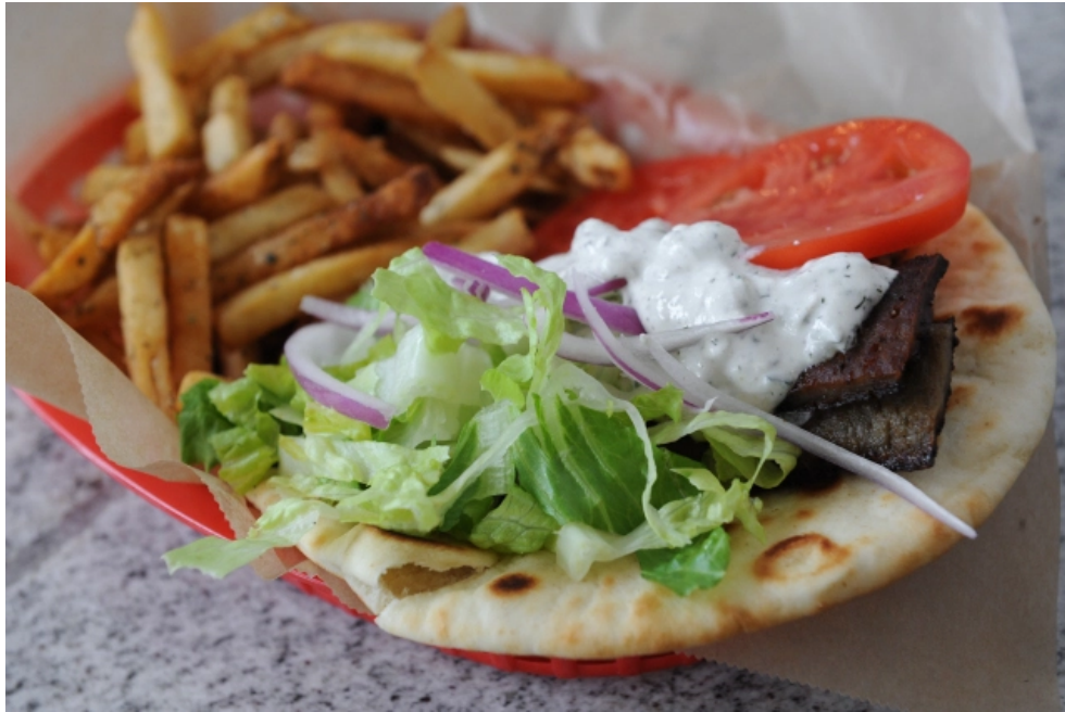
Classic Gyro Wrap at Kafenio in College Park.

around everyone's neck. Hapeville feeds many an employee of these companies, both of which have headquarters nearby.