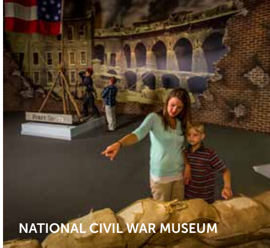
NATIONAL CIVIL WAR MUSEUM