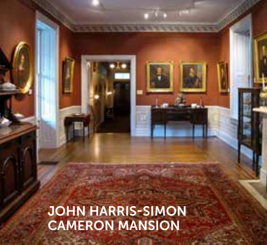
JOHN HARRIS-SIMON CAMERON MANSION