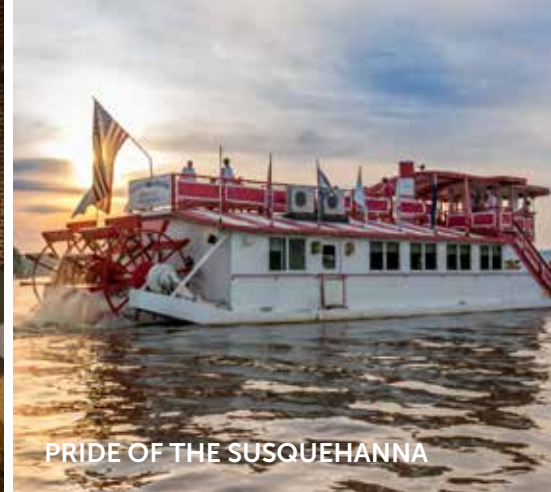
PRIDE OF THE SUSQUEHANNA