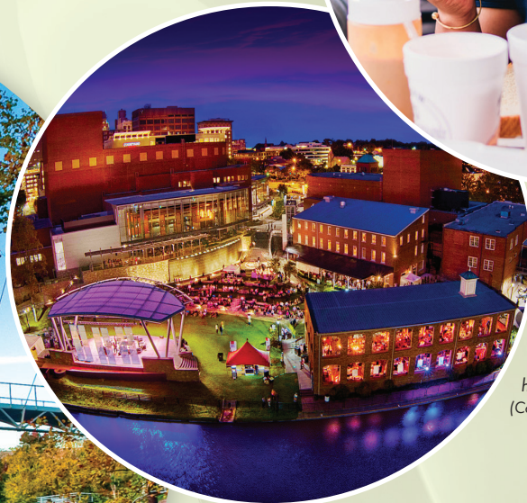
An aerial view of the Peace Center complex during the Euphoria festival held from Sept. 21-24.