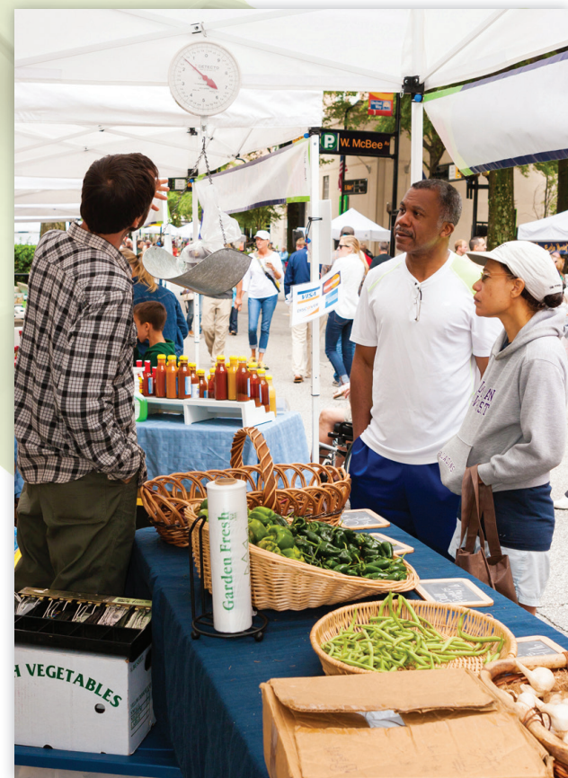
Get the freshest picks from local farmers at the TD Saturday Market held on Main Street each Saturday through Oct. 28.

the TD Saturday Market. Called one of "The South's Best Farmers' Markets" by Southern Living and one of the "13 Farmers' Markets Worth Traveling For" by Bon Appétit, a section of Main Street in downtown is sectioned off and up to 75 vendors fill their stands with fruits and veggies, grass-fed meat, fresh seafood and more. There is also live music, cooking demos, and special activities for kids.