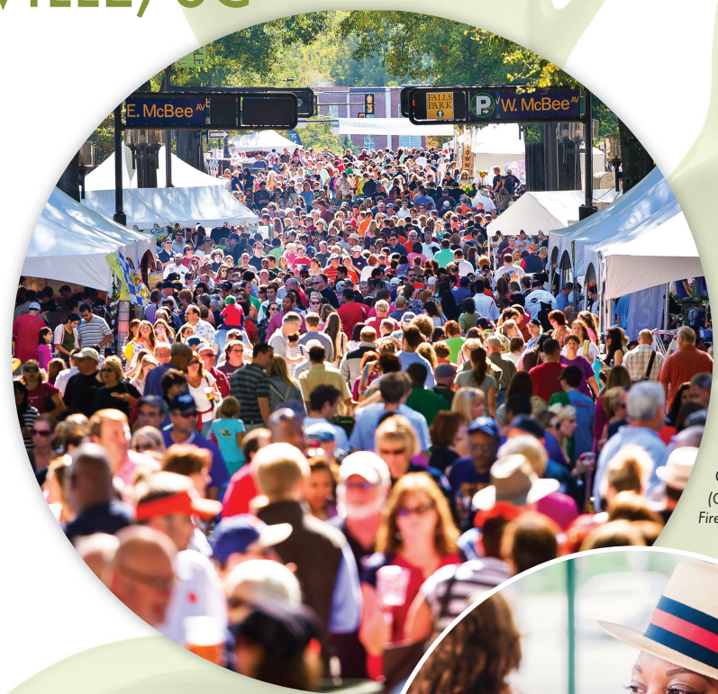
People will gather from all around for BB&T Fall for Greenville presented by Pepsi from Oct. 13-15.

Every Saturday from now until Oct. 28 you can visit