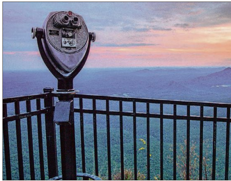
If you're feeling outdoorsy, visit Caesars Head state park and enjoy more than 60 miles of hiking trails and five waterfalls.