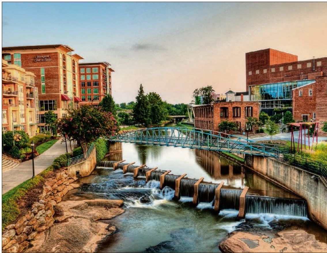
RiverPlace and the Peace Center offer so much to do, whether you're in the mood for shopping or a cocktail, or perhaps a great night of theater.

Whatever activity you choose, fuel up at one of Greenville's eateries focused on fresh local fare. At Swamp Rabbit Cafe & Grocery, options include artisan wood-fired pizzas topped with Clemson blue cheese and roasted organic beets. Enjoy outdoor seating along the Greenville Health System (GHS) Swamp Rabbit Trail; cooking classes and community events also are offered. 205 Cedar Lane Road, Greenville, S.C. 29611, 864-255-3385, www.swamprabbitcafe.com