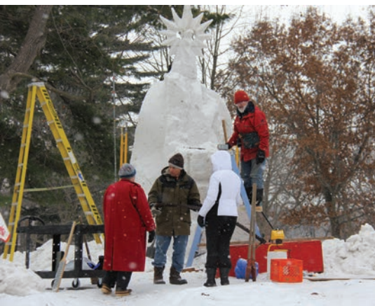
Illinois Snow Sculpting Competition