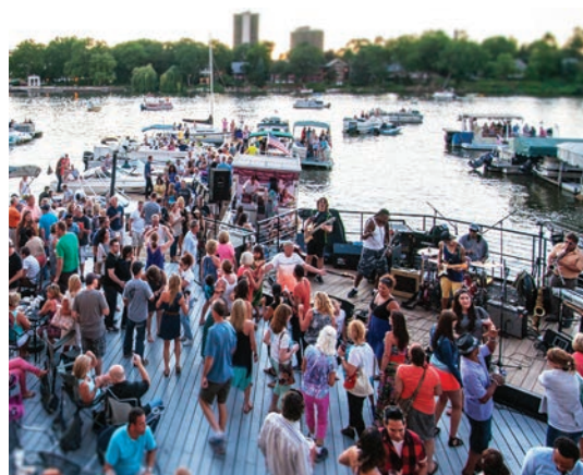
Dinner on the Dock