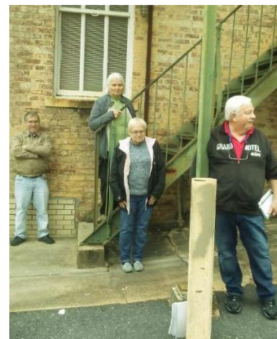
Recreating the R.E.M pose near

These journalists represent media outlets with more than