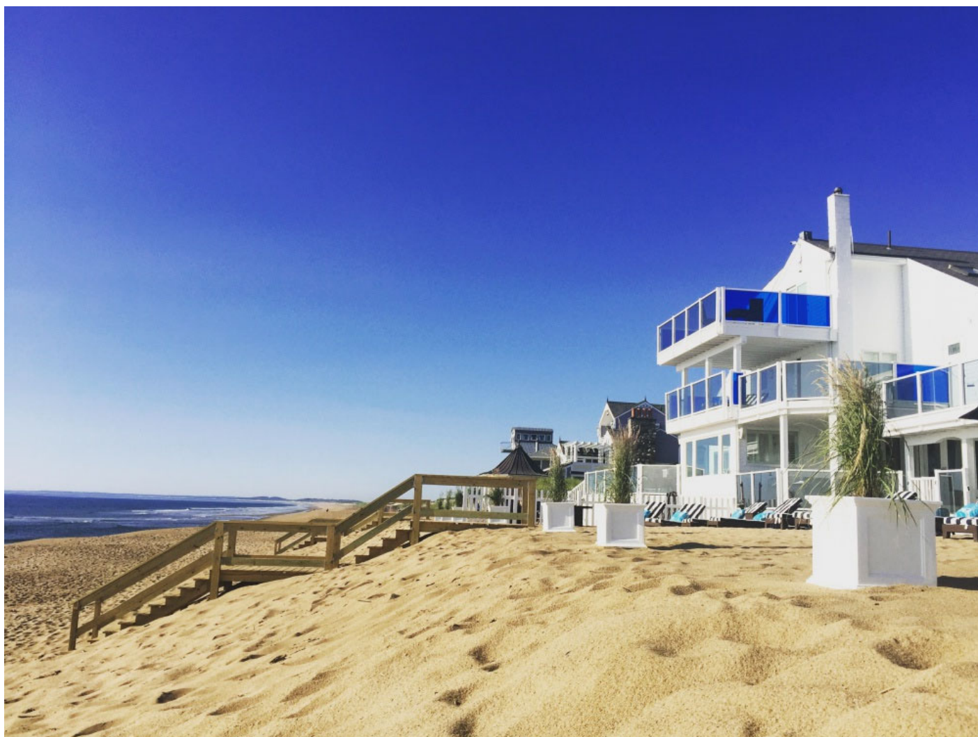
Blue, Plum Island, MA | 10 Best Seaside Inns in New England Aimee Seavey