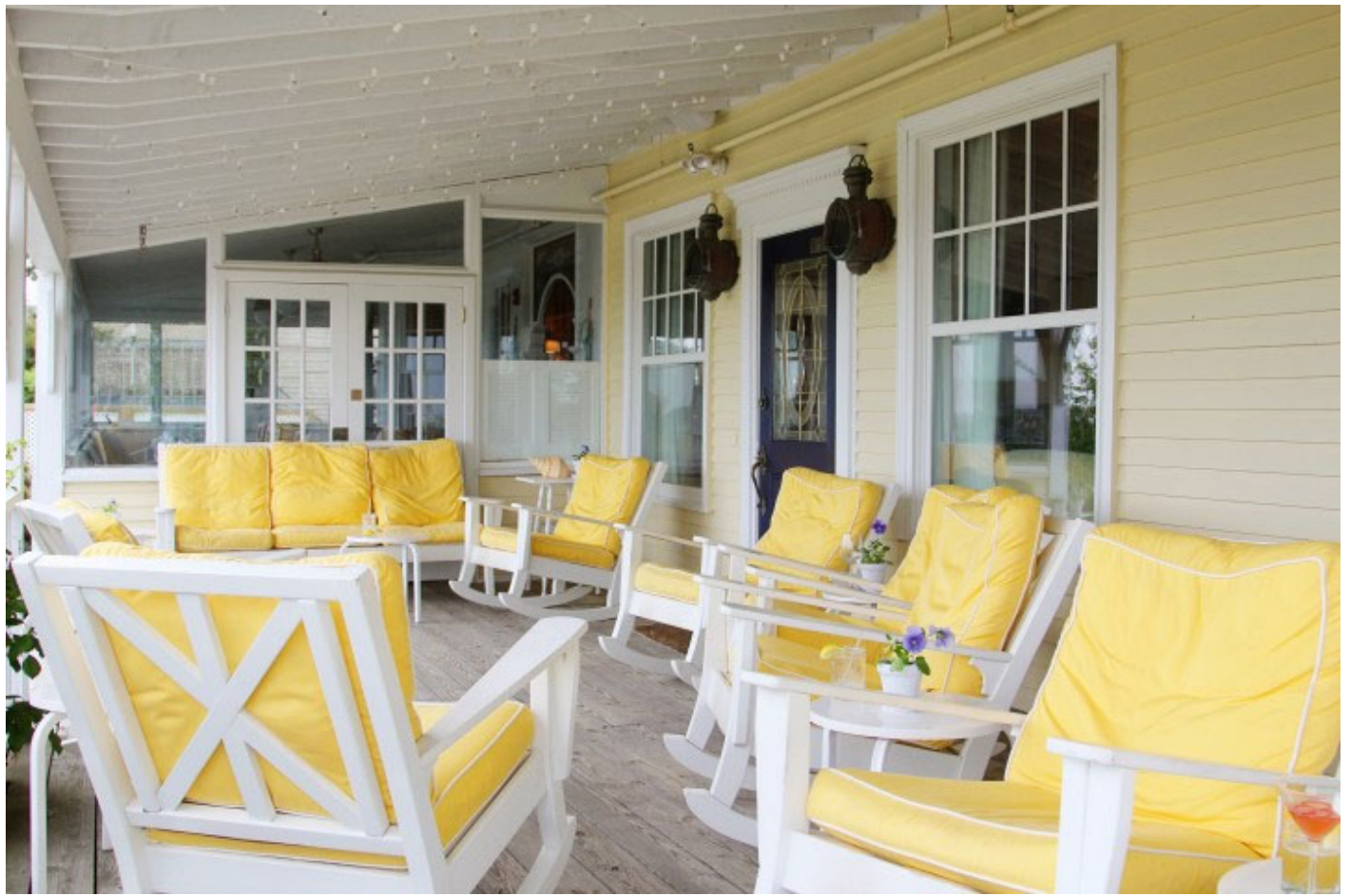
The Tides Beach Club, Kennebunkport, ME | 10 Best Seaside Inns in New England

What may recommend this gorgeous little inn with just 11 rooms overlooking Menemsha Harbor on Martha's Vineyard is that it's likely you can't get cell service here. Let the romance begin, with private patios, cozy hammocks, country-French décor and a stunning destination restaurant.