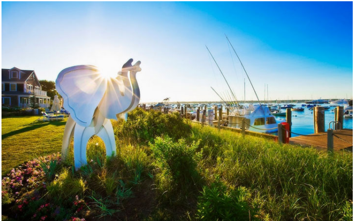
The White Elephant Inn, Nantucket, MA | 10 Best Seaside Inns in New England White Elephant Inn