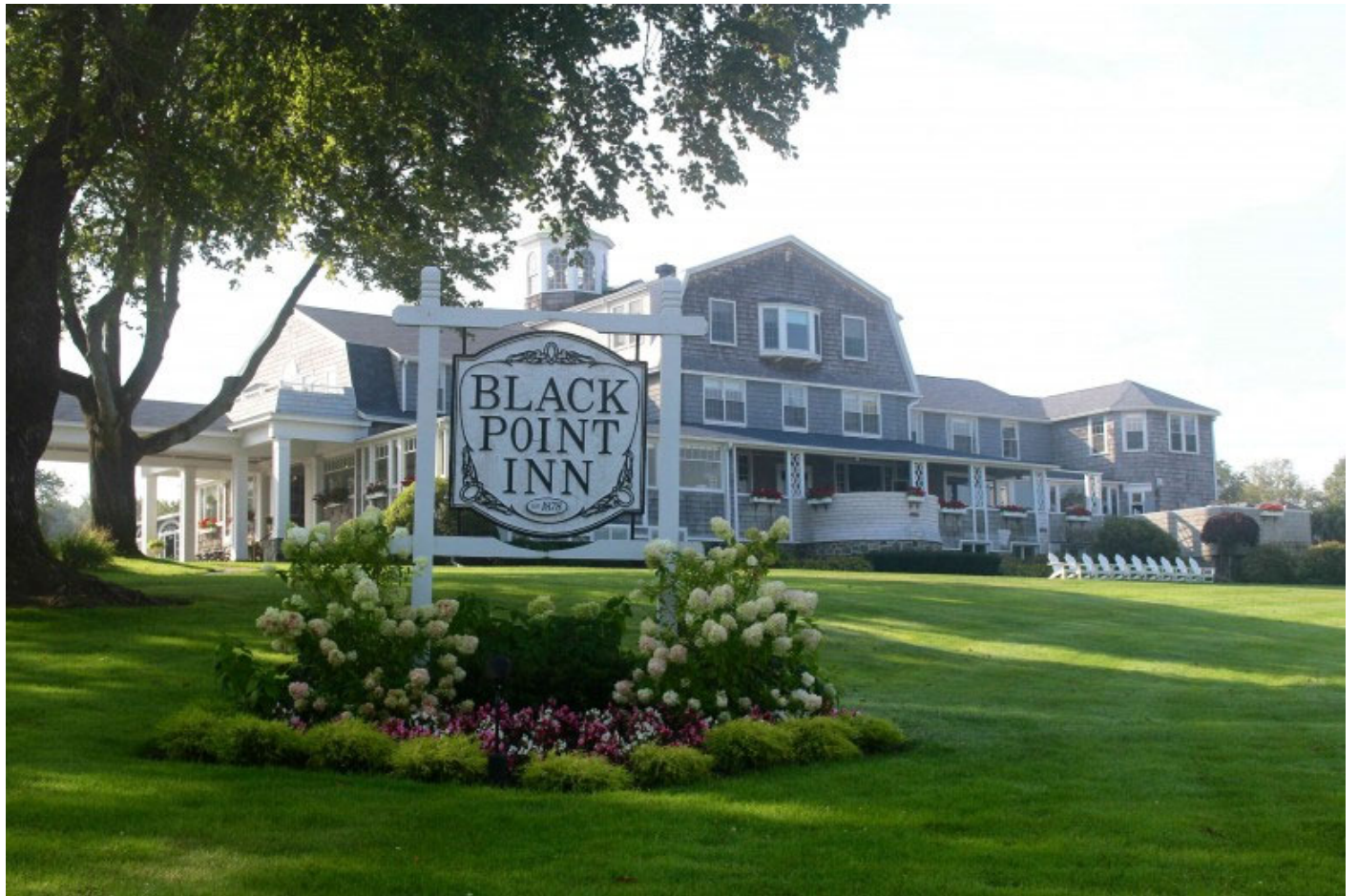
The Black Point Inn | 10 Best Seaside Inns in New England Annie Graves

Sophisticated, impeccably designed, and an easy stroll to the bustling fun of Nantucket Harbor , the rooms and suites in the Hotel building or any of the Village residences are pure luxury. Don't miss the afternoon port and cheese tastings, and cocktails at the property's Brant Point Grill are a seaside must.