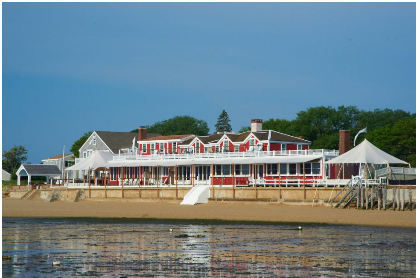
The Red Inn | 10 Best Seaside Inns in New England

A resplendent Victorian grande dame that got considerably grander with its 2010 renovation, Ocean House is peak luxury in Rhode Island's laid-back but nonetheless exclusive summer enclave. There's a resident croquet pro (book a lesson), and the resort's OH! Spa is world-class. Named a 2018 Yankee Editors' Choice for "Best Luxury Escape."