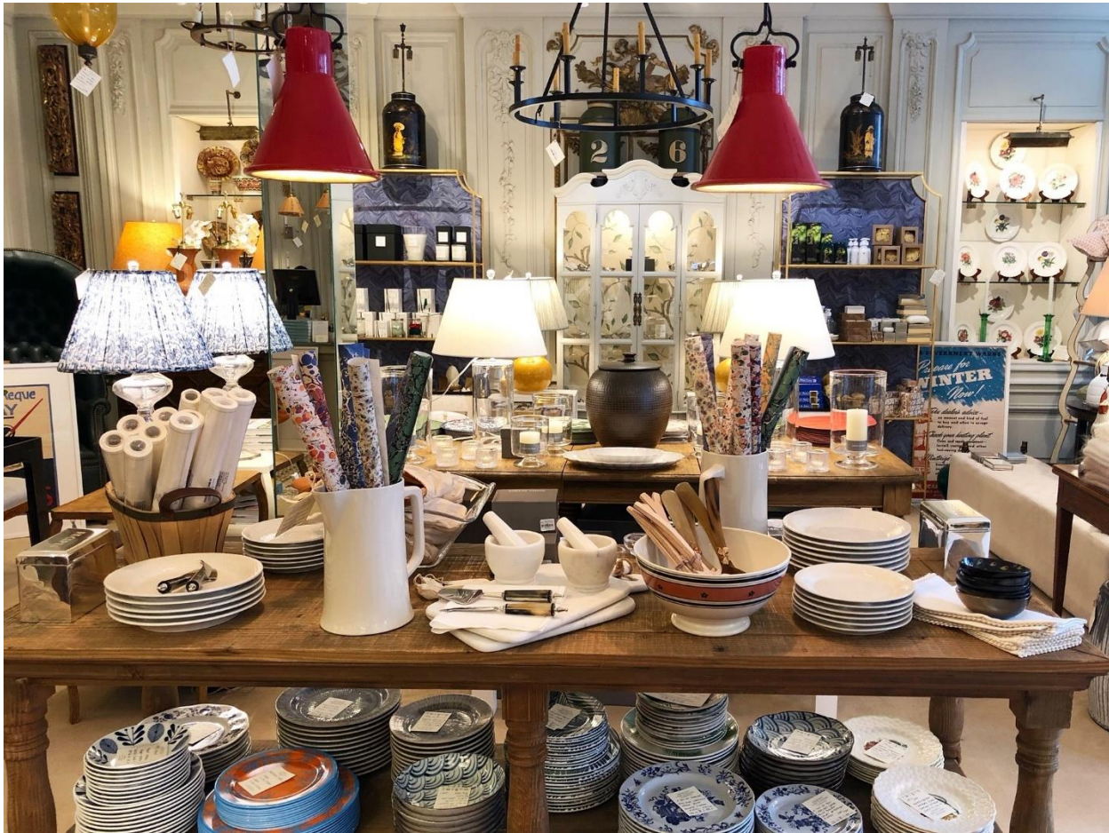
The wares on offer at the Newport Lampshade Company