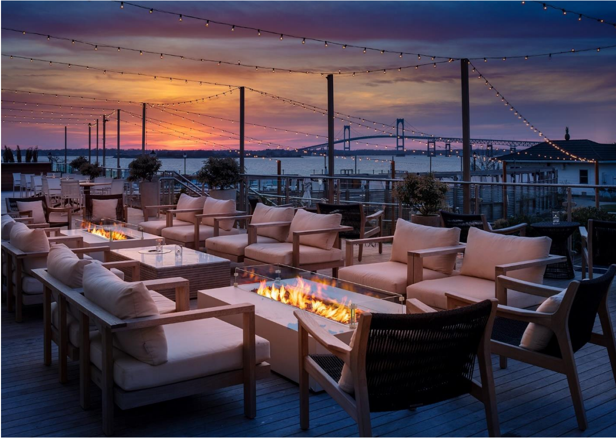
The outdoor patio at Gurney's Newport.