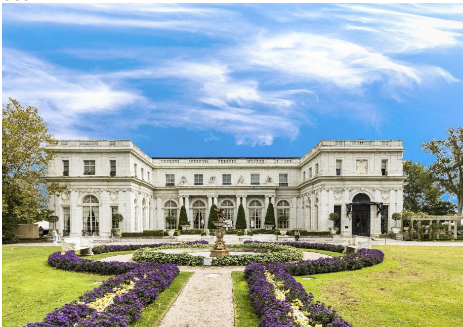
The historic Rosecliff Mansion.