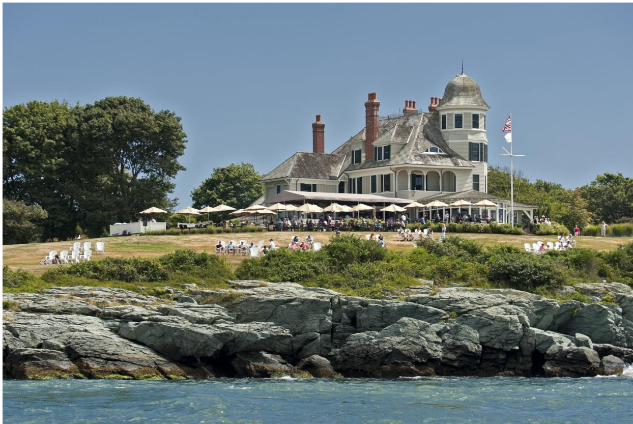
The Lawn at Castle Hill Inn