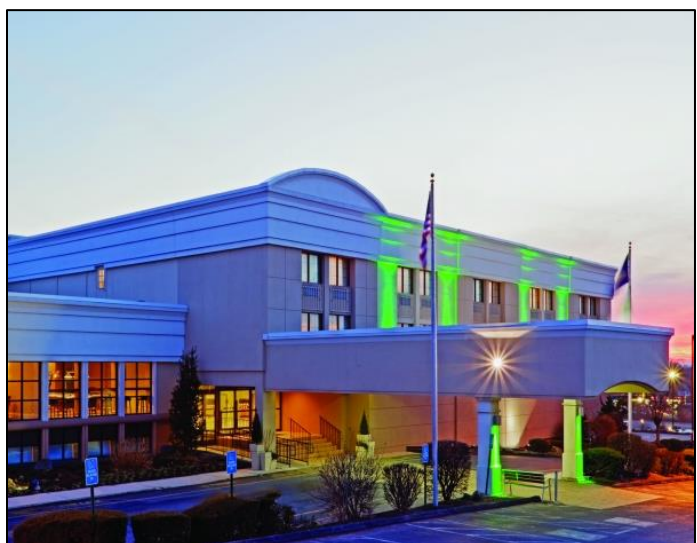
The Red Lion Hotel is convenience personified.