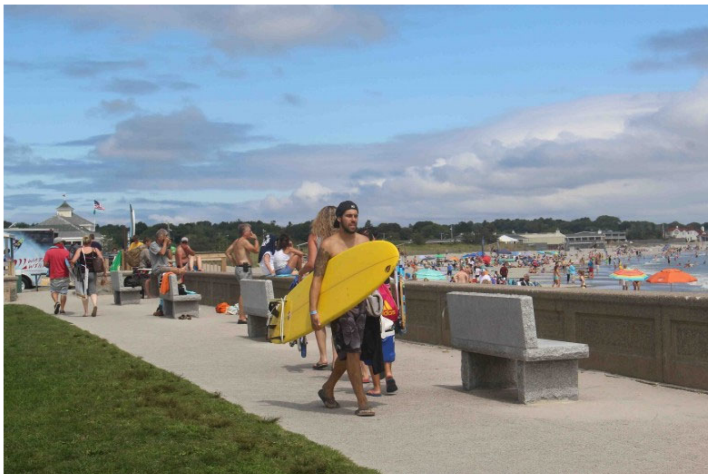
Town Beach in Narragansett, Rhode Island | 5 Favorite Rhode Island Beaches