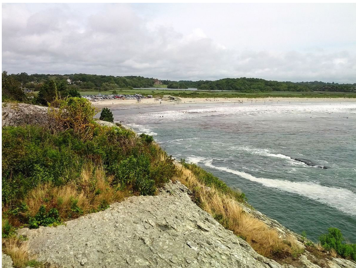
Second Beach in Middletown | 5 Favorite Rhode Island Beaches