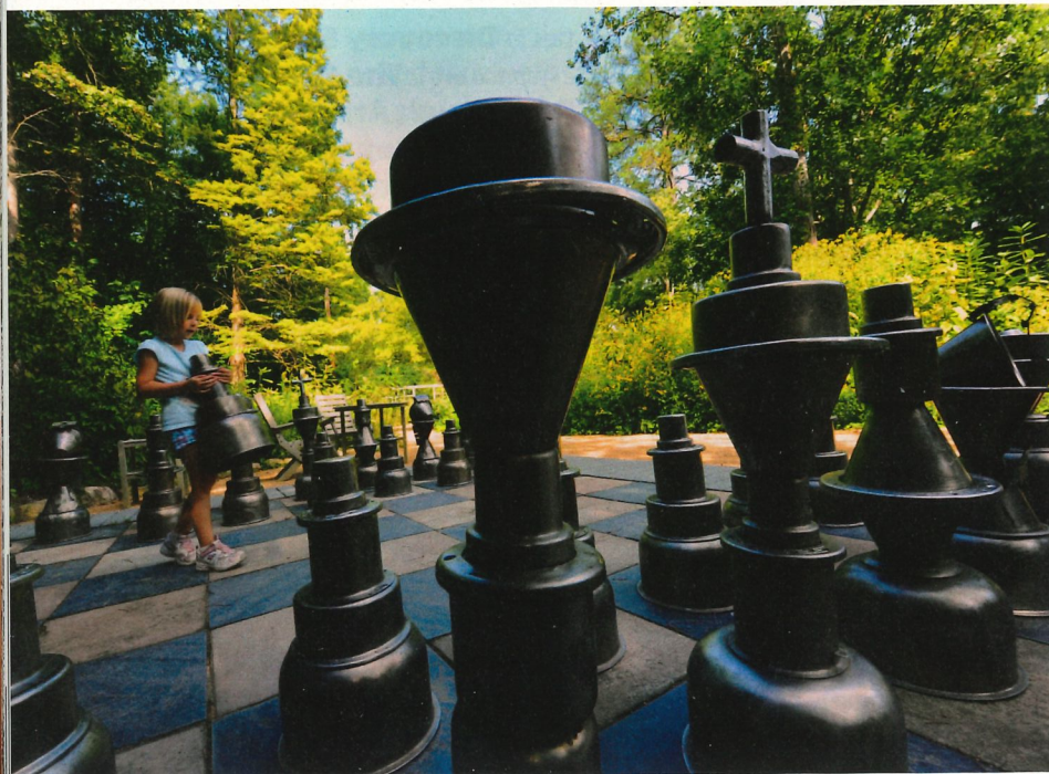
Right: Morehead Planetarium & Science Center Left: North Carolina Botanical Garden

cultures and centuries. With all those hungry students (and visitors), the food and beverage scene here is pretty stellar, with on-campus staples like Cafe Laura ( cafe-laura.psu.edu ) and newer options across College Avenue, like Local Whiskey ( localwhiskeybar.com ) for dram fans or Liberty Craft House ( dantesinc.com/locations/liberty-craft-house ), a brewhouse with an industrial vibe.