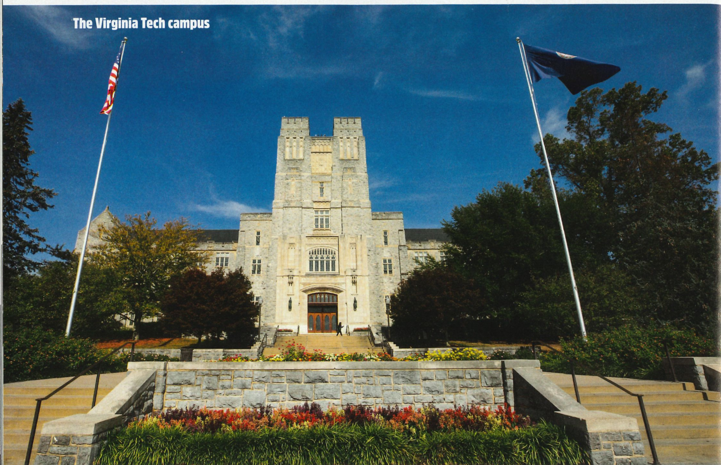
The Virginia Tech campus