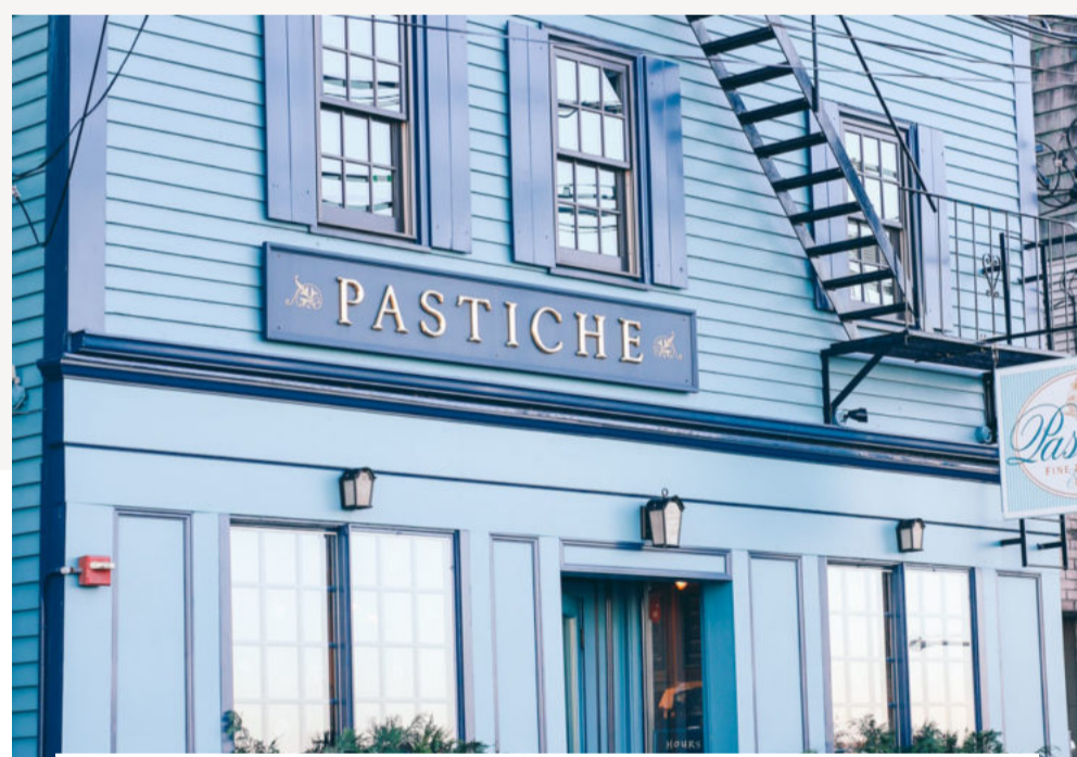
6 MUST VISIT PROVIDENCE COFFEE SHOPS