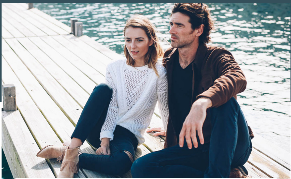
INSTAGRAM Come follow along for more style, home, behind the scenes and more