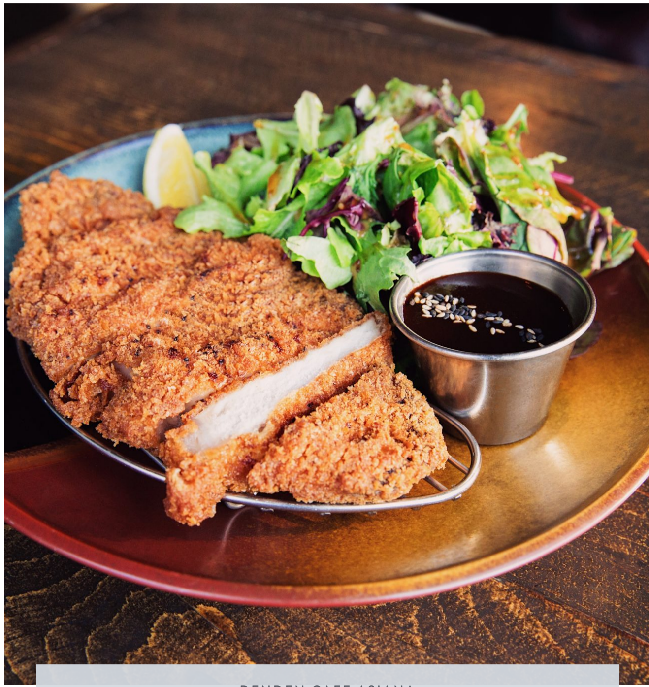
DENDEN CAFE ASIANA