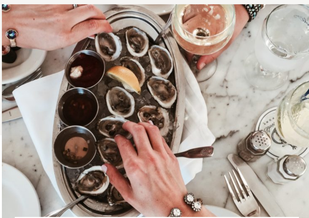
7 GREAT PLACES FOR BRUNCH IN RHODE ISLAND