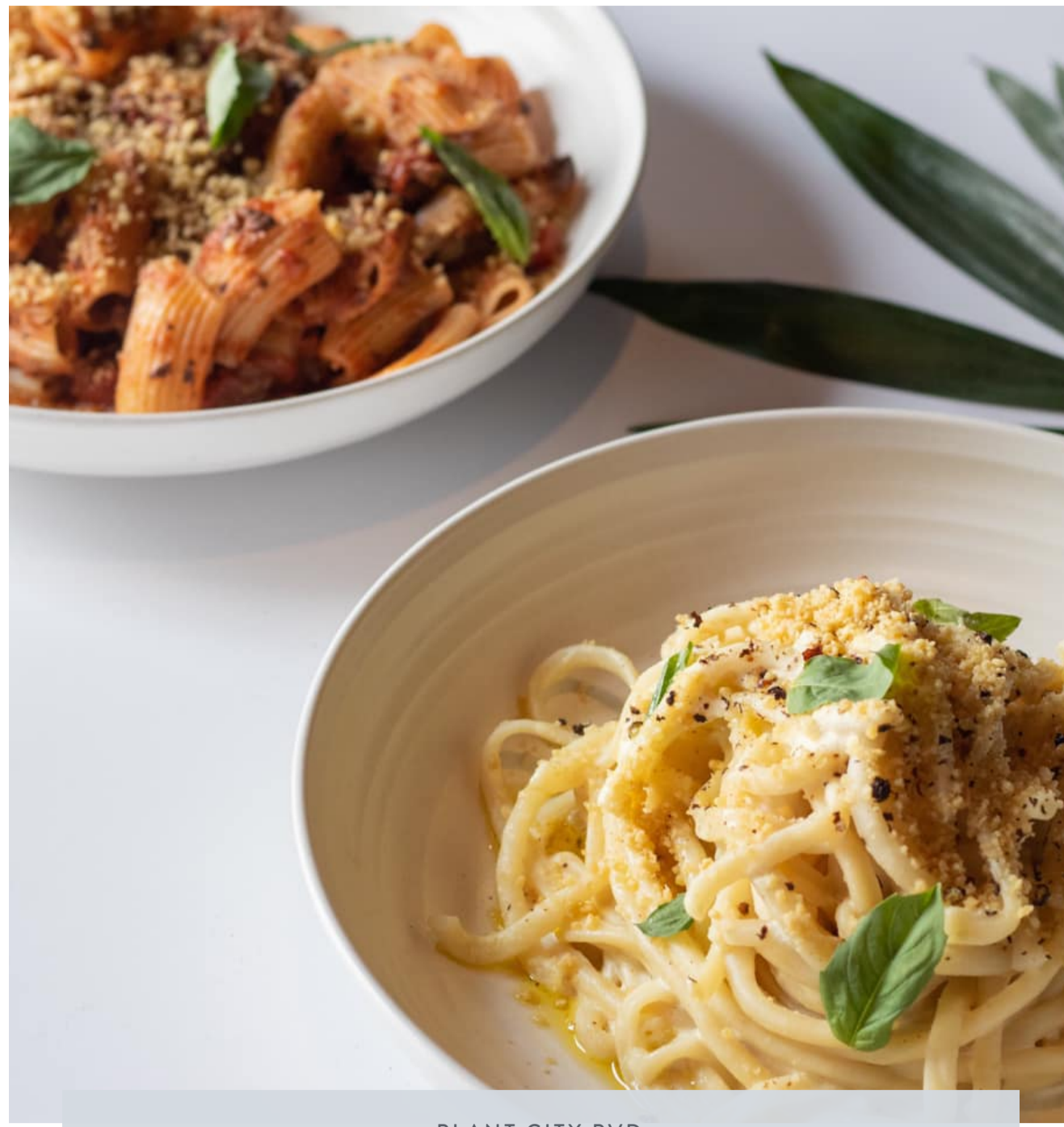
PLANT CITY PVD