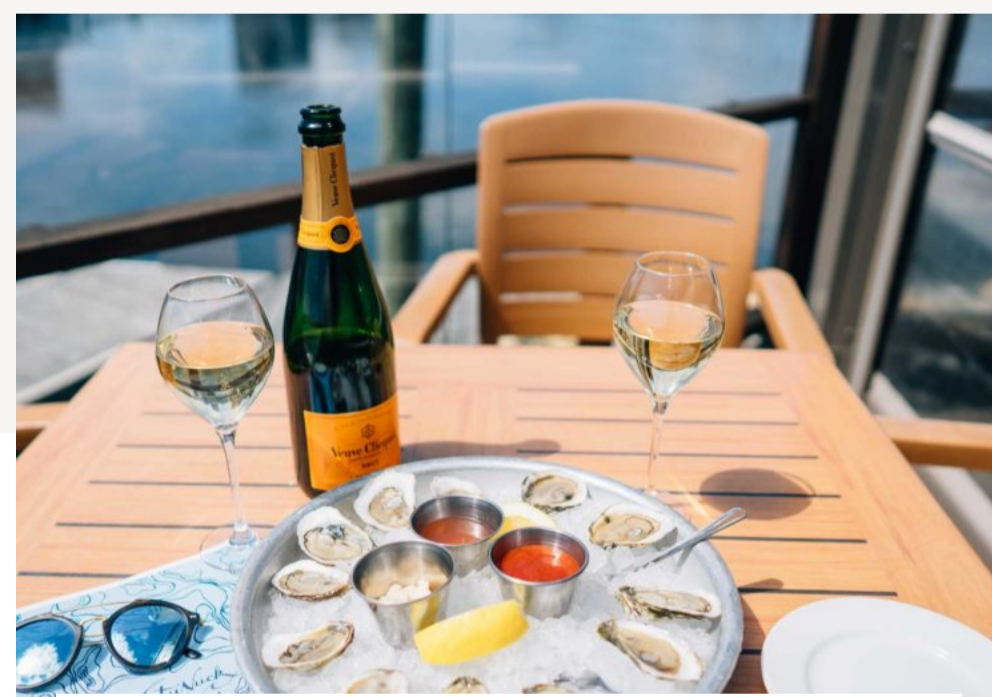
FOUR GREAT PLACES FOR OYSTERS IN RHODE ISLAND