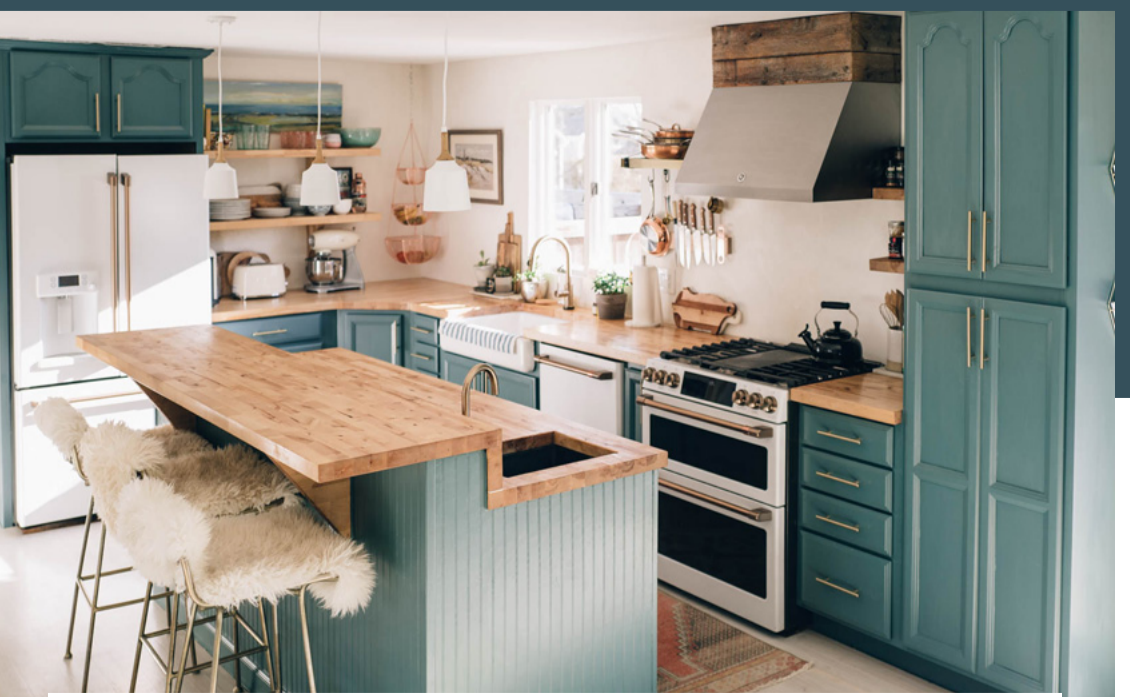
BROWSE THE SHOP Shop The Cozy Ranch decor, and Jess's classic style-picks