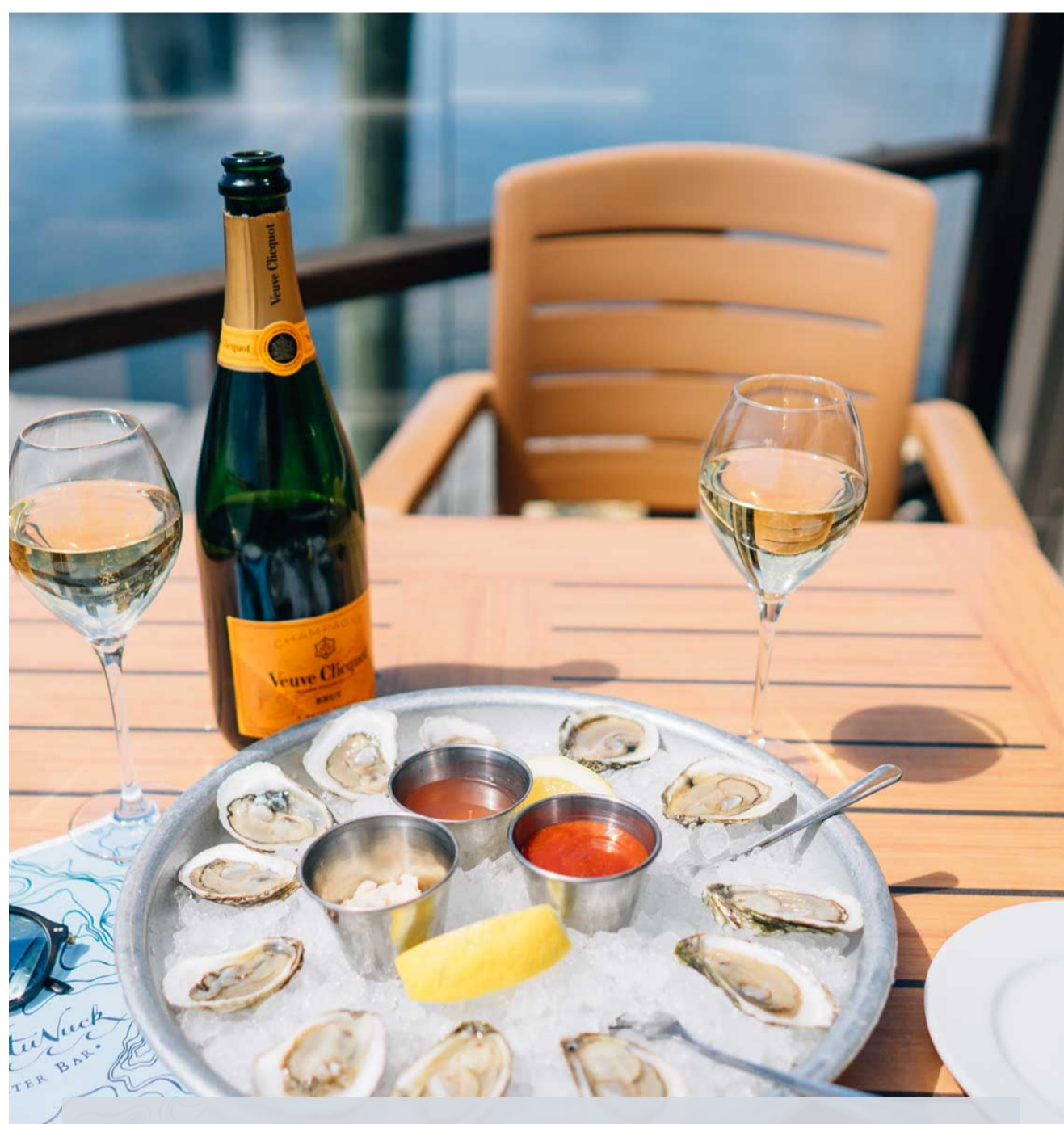
MATUNUCK OYSTER BAR