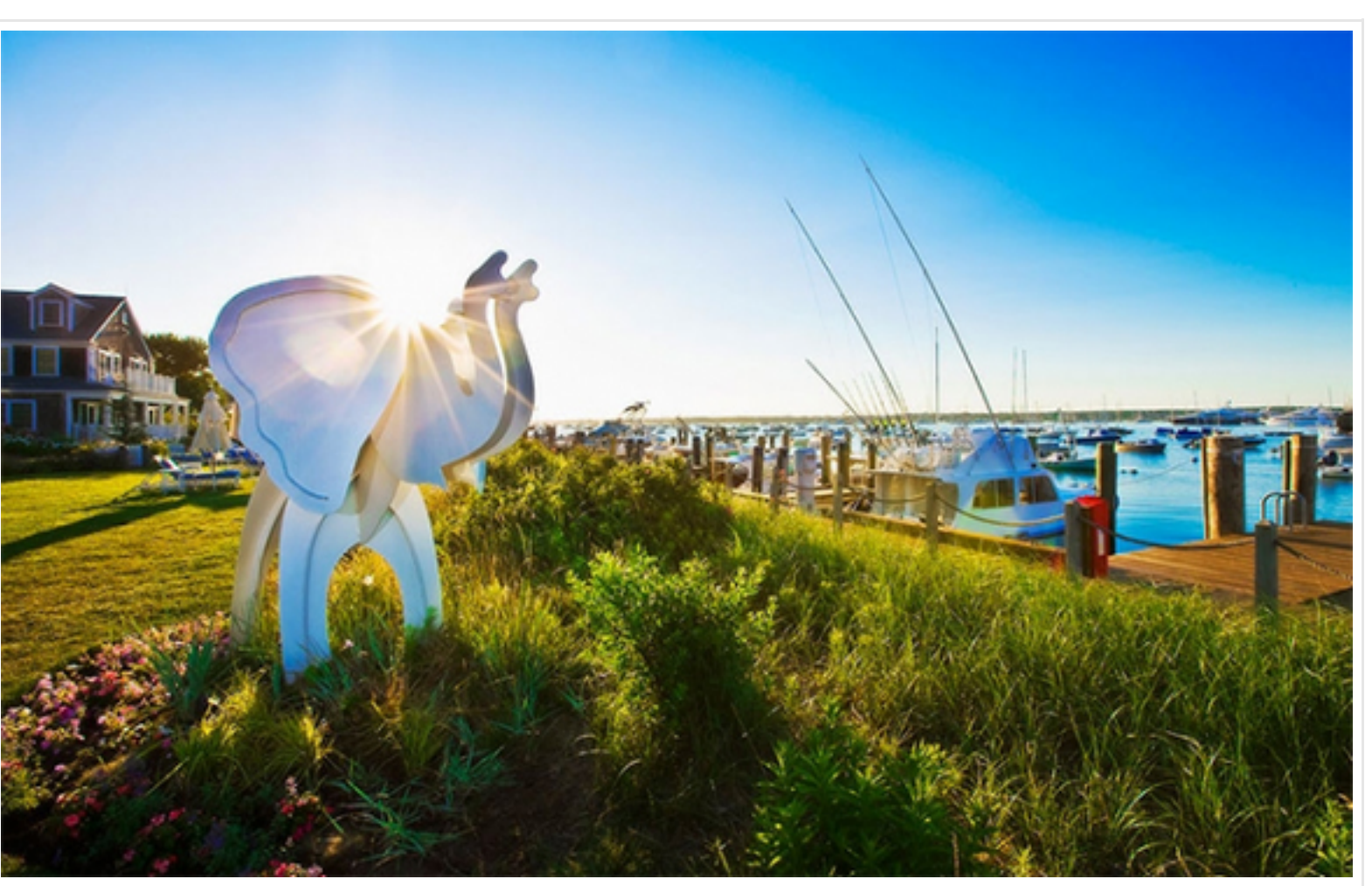
The White Elephant Inn, Nantucket, MA | 10 Best Seaside Inns in New England