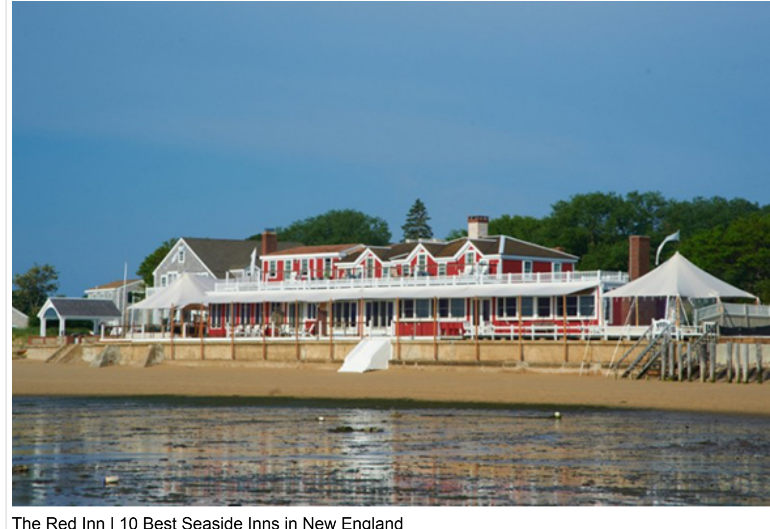
The Red Inn | 10 Best Seaside Inns in New England

A resplendent Victorian grande dame that got considerably grander with its 2010 renovation, Ocean House is peak luxury in Rhode Island's laid-back but nonetheless exclusive summer enclave. There's a resident croquet pro (book a lesson), and the resort's OH! Spa is world-class. Named a 2018 Yankee Editors' Choice for "Best Luxury Escape."