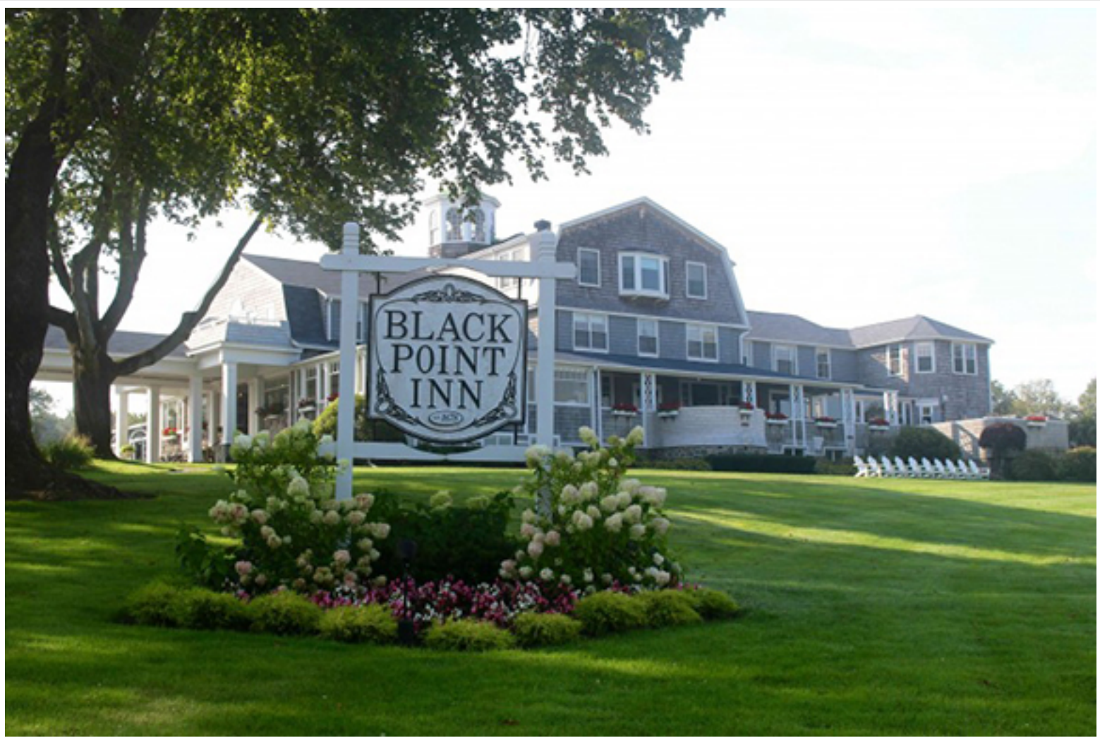
The Black Point Inn | 10 Best Seaside Inns in New England Annie Graves

Sophisticated, impeccably designed, and an easy stroll to the bustling fun of Nantucket Harbor, the rooms and suites in the Hotel building or any of the Village residences are pure luxury. Don't miss the afternoon port and cheese tastings, and cocktails at the property's Brant Point Grill are a seaside must.