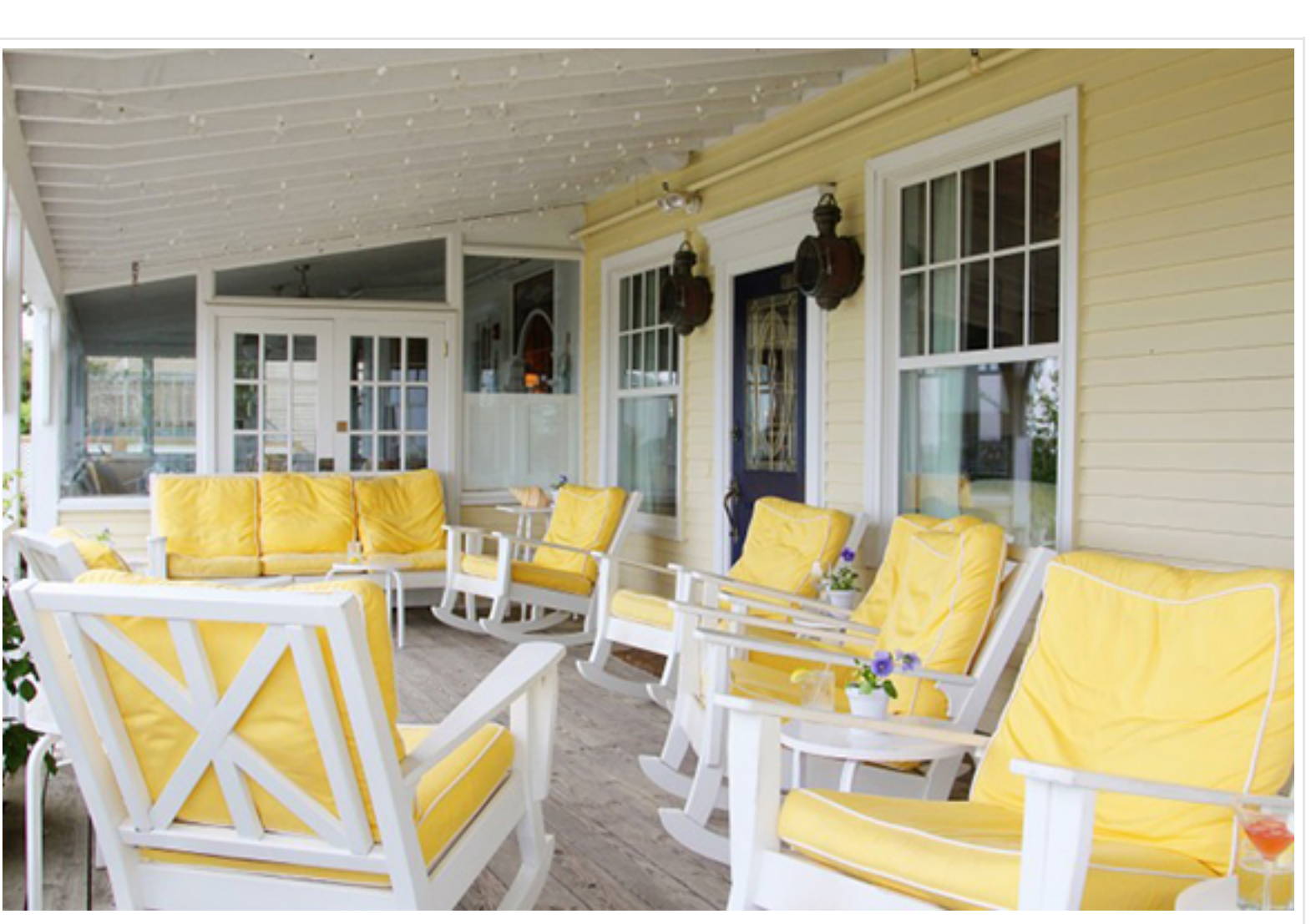
The Tides Beach Club, Kennebunkport, ME | 10 Best Seaside Inns in New England

The Tides Beach Club | Kennebunkport, ME