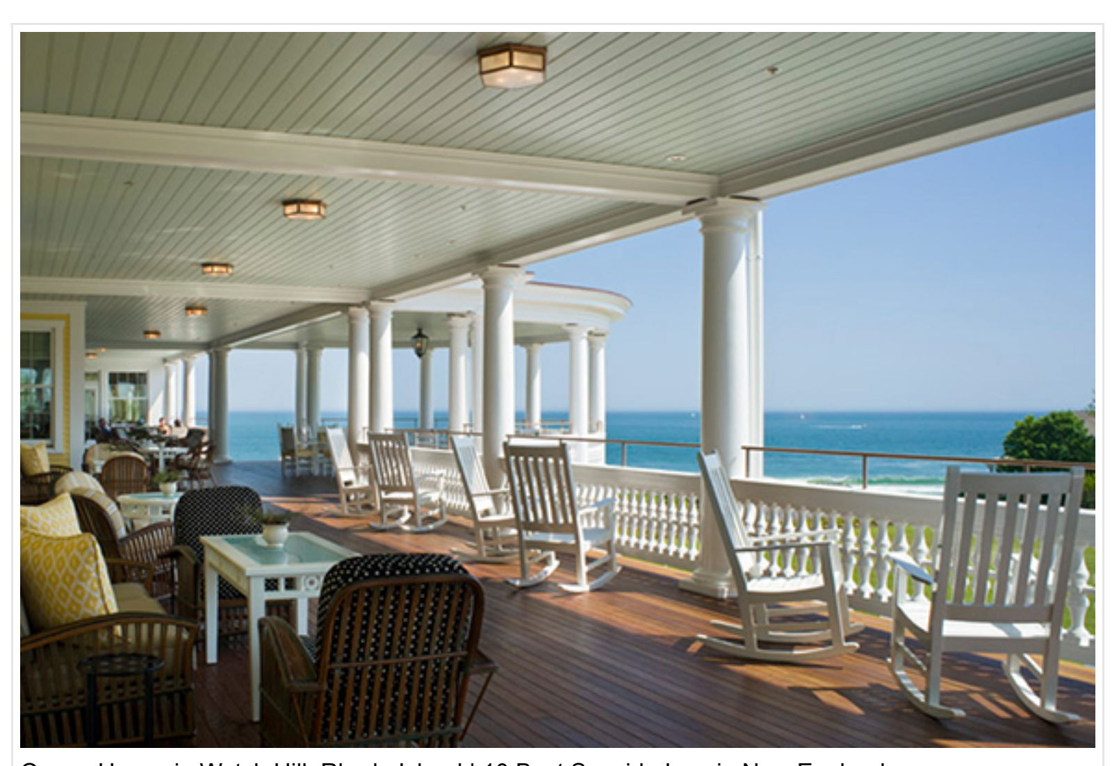
Ocean House in Watch Hill, Rhode Island | 10 Best Seaside Inns in New England

At the mouth of the only fjord on the East Coast (Somes Sound), this historic retreat has retained the charms of bygone days: a clay tennis court and two tournament-class croquet courts, rowboats, rush-seated rockers on the porch, and a serenading pianist at cocktail hour. Consider coming for August's Croquet Classic. Named a 2018 Yankee Editors' Choice for "Best Historic Hotel."