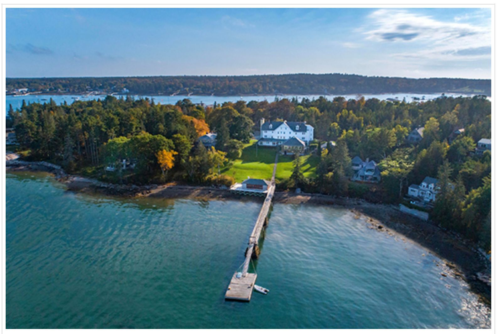
The Claremont Hotel in Southwest Harbor, Maine | 10 Best Seaside Inns in New England