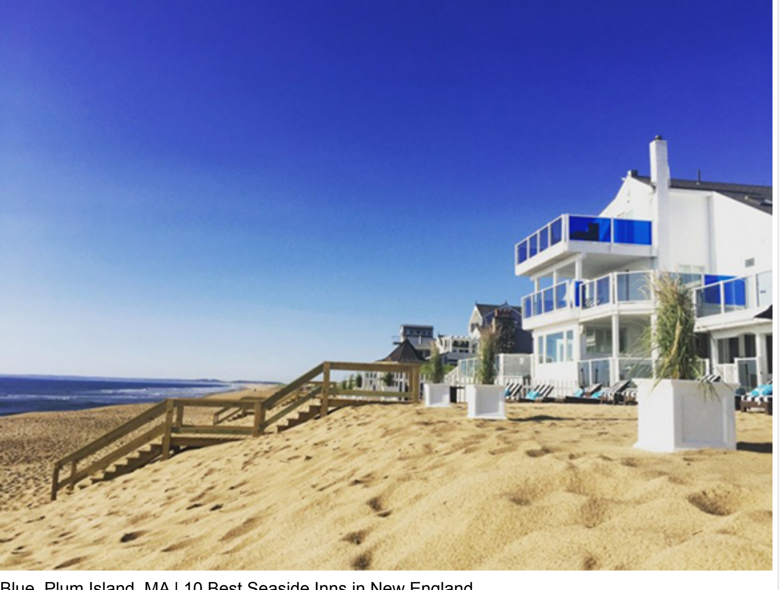
Blue, Plum Island, MA | 10 Best Seaside Inns in New England Aimee Seavey

This historic grey-shingled inn set on Winslow Homer's beloved Prouts Neck is a deluxe getaway from May through October, and pulls out all the stops with a summer special for four-night stays that includes either a complimentary sail on a vintage, Maine-built schooner or lobstering expedition on Casco Bay.