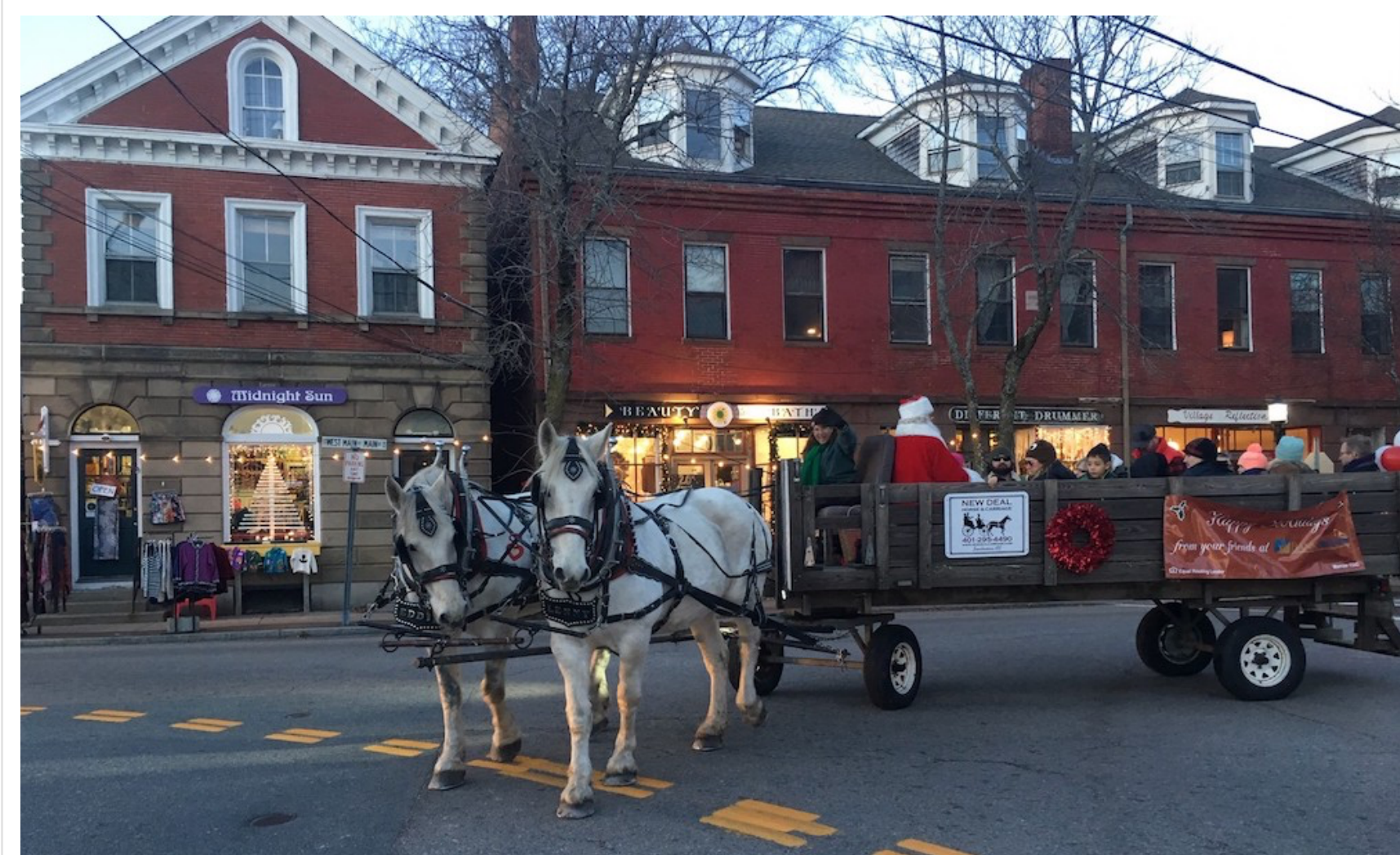
Kiddos ride along with Santa as he trades reindeer for carriage horses in downtown Wickford.

Guests are kindly asked to bring an unwrapped toy for the hotel's holiday toy drive.