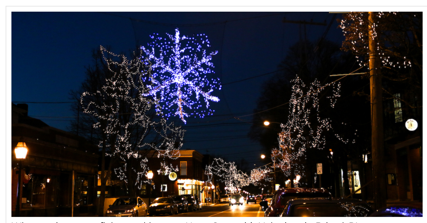
When a giant snowflake sparkles over Hope Street, it's Yule time in Bristol, RI. Discover Newport

But the Yuletide spirit also shines brightly in many of Newport's neighbors by the sea — close-knit towns like Bristol and North Kingstown — that put so much energy into making merry, it's worth saving the date so you can get in on the fun, too. With that in mind, here are some favorite holiday celebrations in coastal Rhode Island.