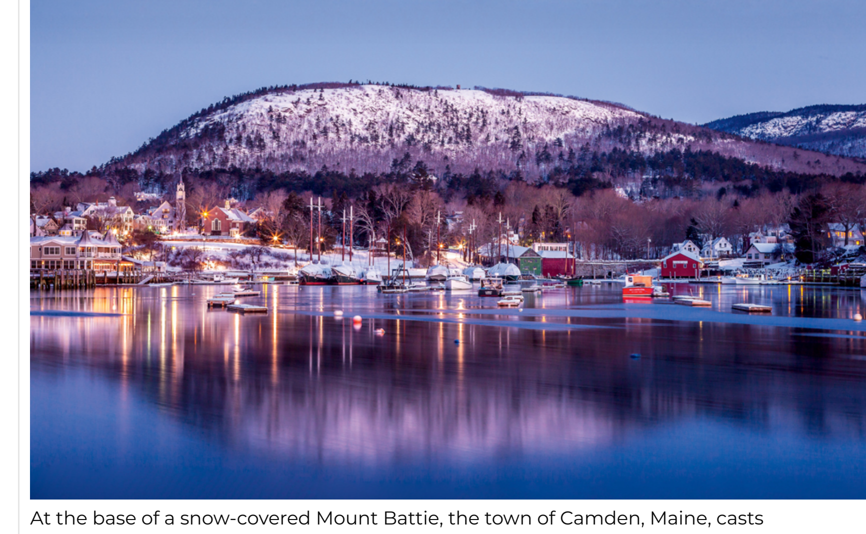
29 Best Cozy New England Winter Towns CONNECTICUT

Just as foliage time transforms New England into a wondrous new landscape to explore, so, too, does winter. Yet experiencing the best of the snowy season isn't always about being outdoors. Sometimes it's all about finding a place that envelops you in history, scenery, and a sense of profound contentment when a chill wind blows. New England is filled with towns that can do just that; the following are some of our favorites.