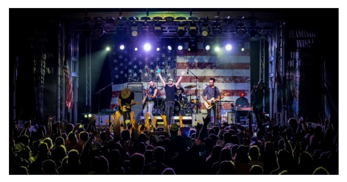
The World's Fishing Fair Concerts for Conservation lineup features some of the biggest names in country music.

The 2022 World's Fishing Fair will be the second iteration of the storied event. Building on the success of World's Fishing Fair in 1988, this <u>year's fair</u> <u>is destined to be the largest event in the history of angling.</u> Concerts for Conservation provide visitors the opportunity to support conservation and have a blast at performances by a world class lineup of country music stars. Joining country music headliners are NASCAR legends, America's top fishing pros, top outdoor personalities and some of the brightest minds on the conservation landscape.