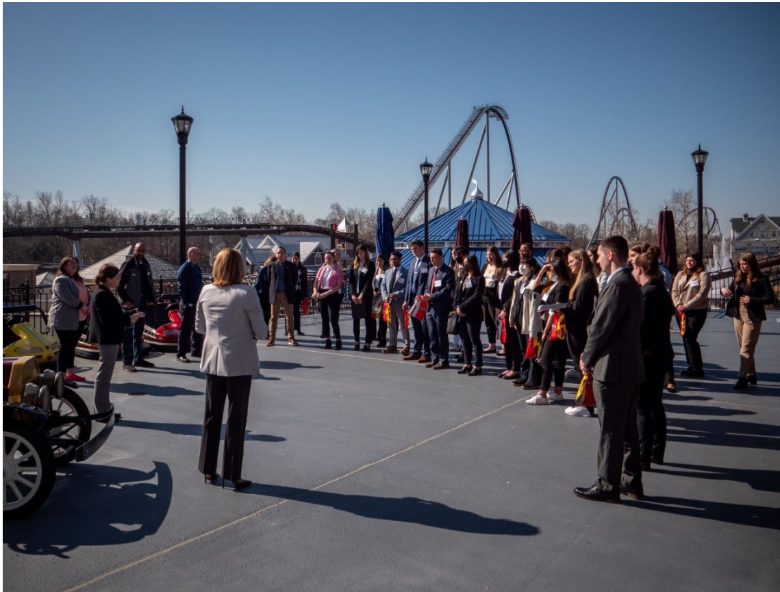
Filename CC3: Students from Temple University's School of Sport, Tourism and Hospitality Management visit Hershey's Chocolate World during the morning site tour. Visit Hershey & Harrisburg Career Connections 3.16.22