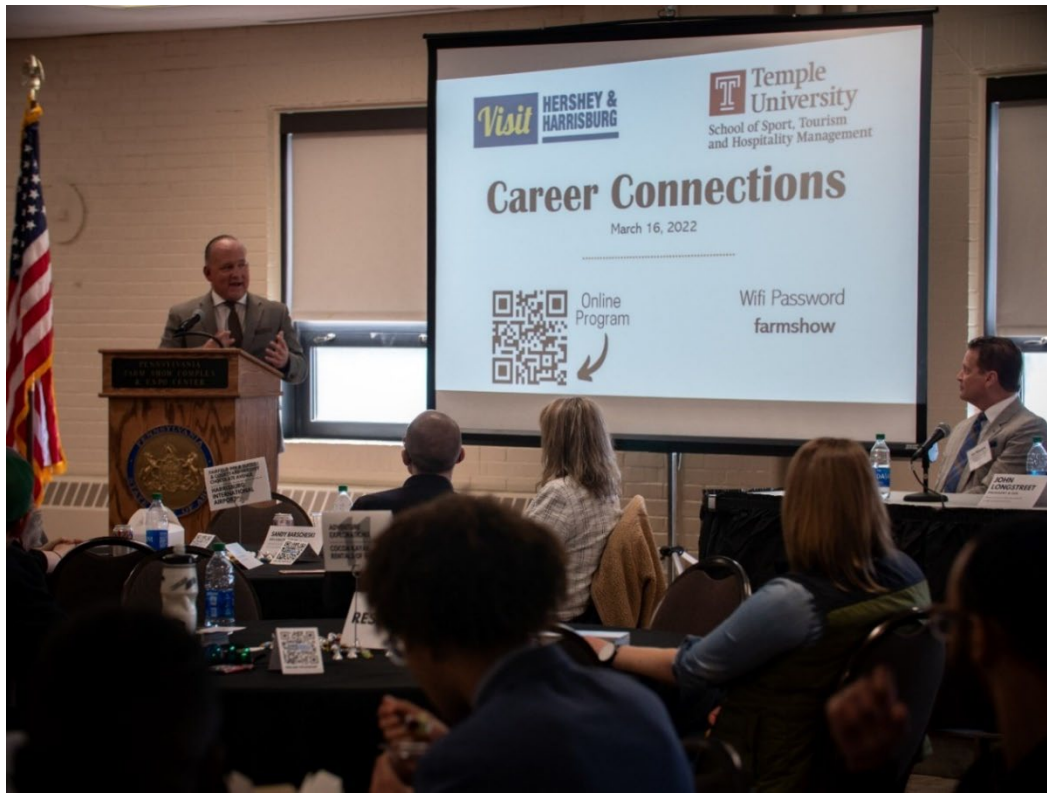
Filename CC7: Students from Temple University's School of Sport, Tourism and Hospitality Management talk with Visit Hershey & Harrisburg Partners about tourism-related businesses at the PA Farm Show Complex & Expo Center. Visit Hershey & Harrisburg Career Connections 3.16.22