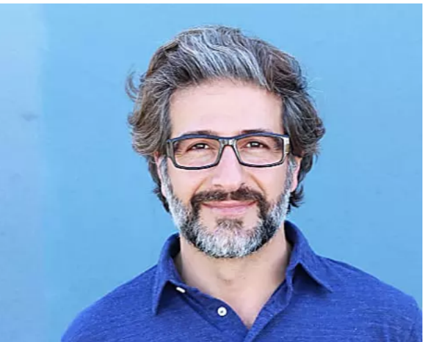
Not Ignore If You Have Excellent Credit NerdWallet