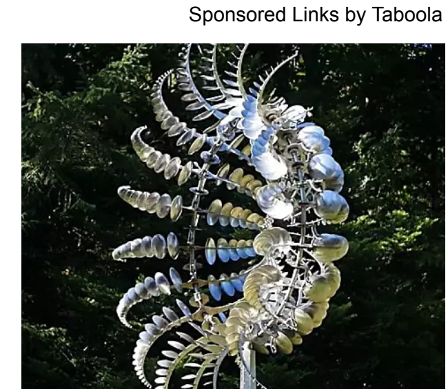
Unique And Magical Metal Windmill - Free Shipping Worldwide! Shop Now hokrlobe