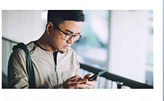
Get LifeLock Identity Theft 6 Credit Cards You Should Protection Now Get LifeLock LifeLock