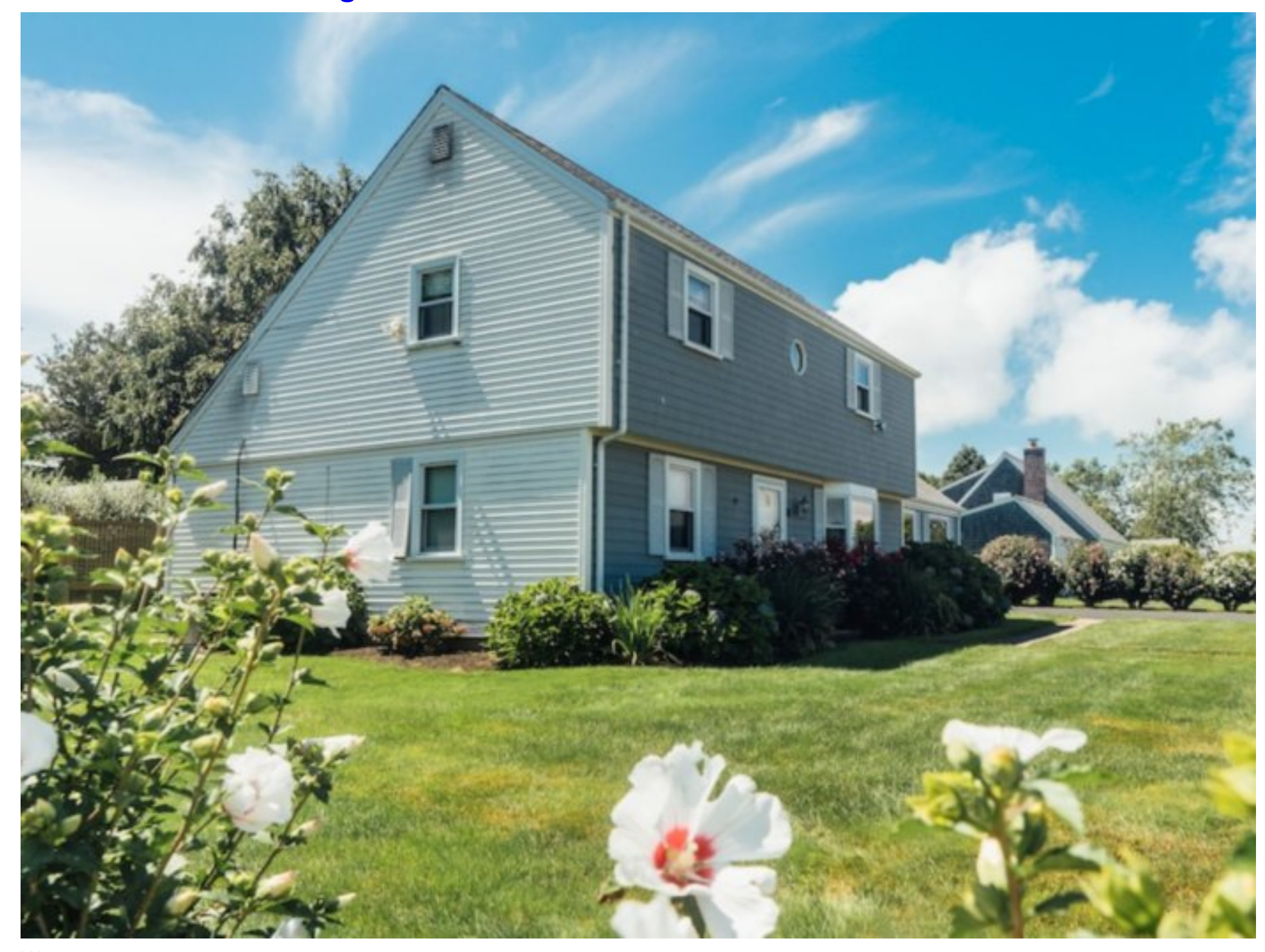
As you can see, the calm setting surrounding this charming rental looks like a painting.

Since the rooms in this cottage are so spacious, you'll have plenty of space to relax and unwind.