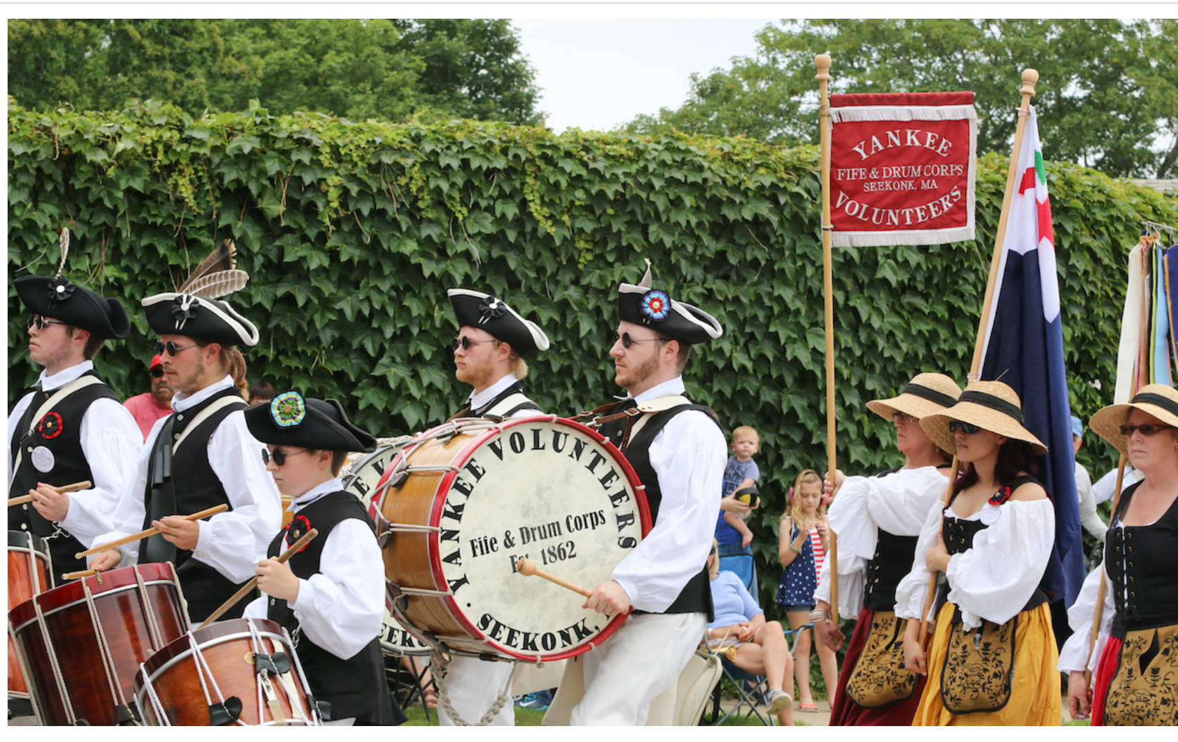
Bristol Fourth of July Parade | Best Summer Coastal Events in Rhode Island Discover Newport

and drink for sale by local charitable organizations.