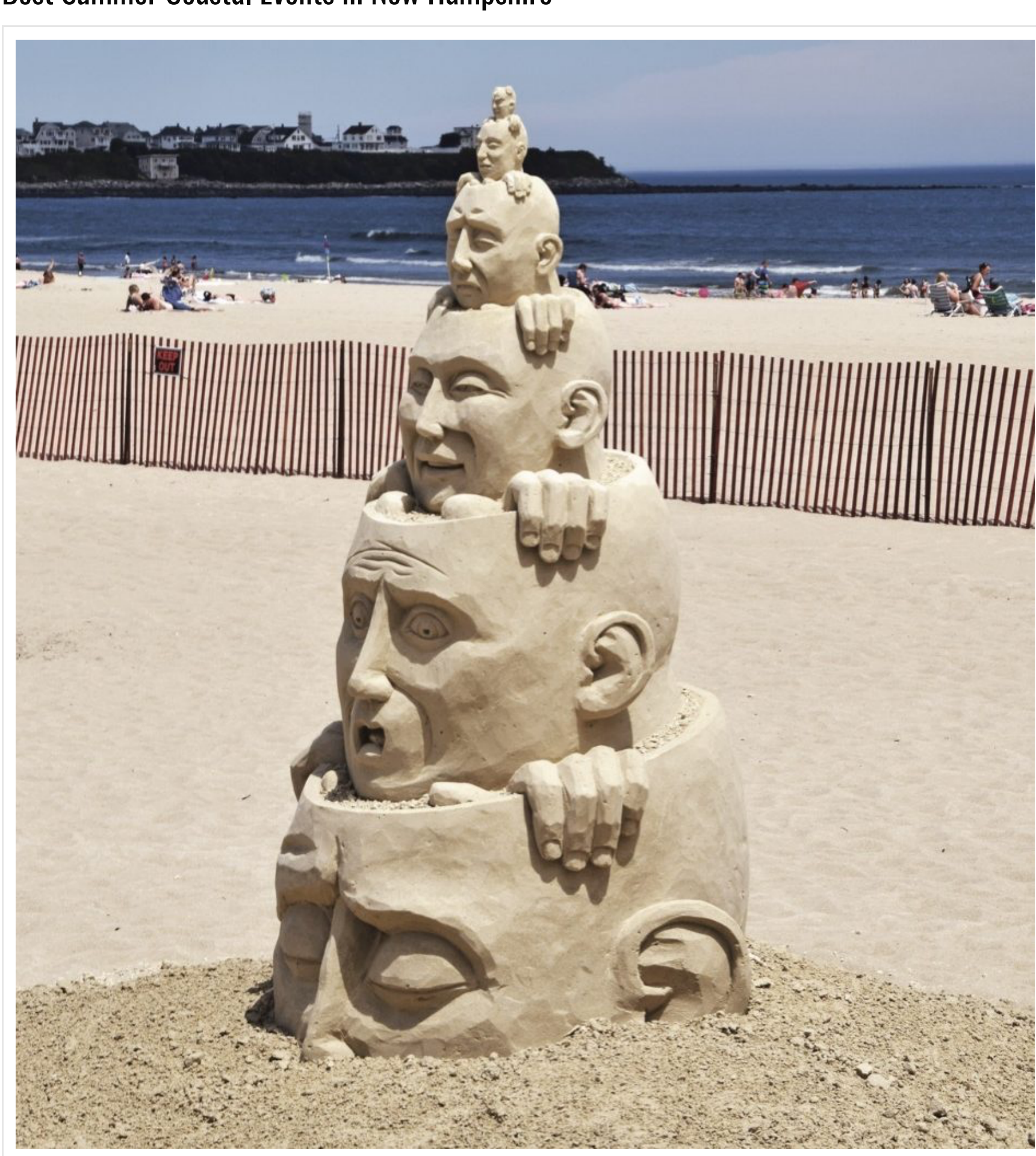
Hampton Beach Master Sand Sculpting Classic | Best Summer Coastal Events in New

Best Summer Coastal Events in New Hampshire