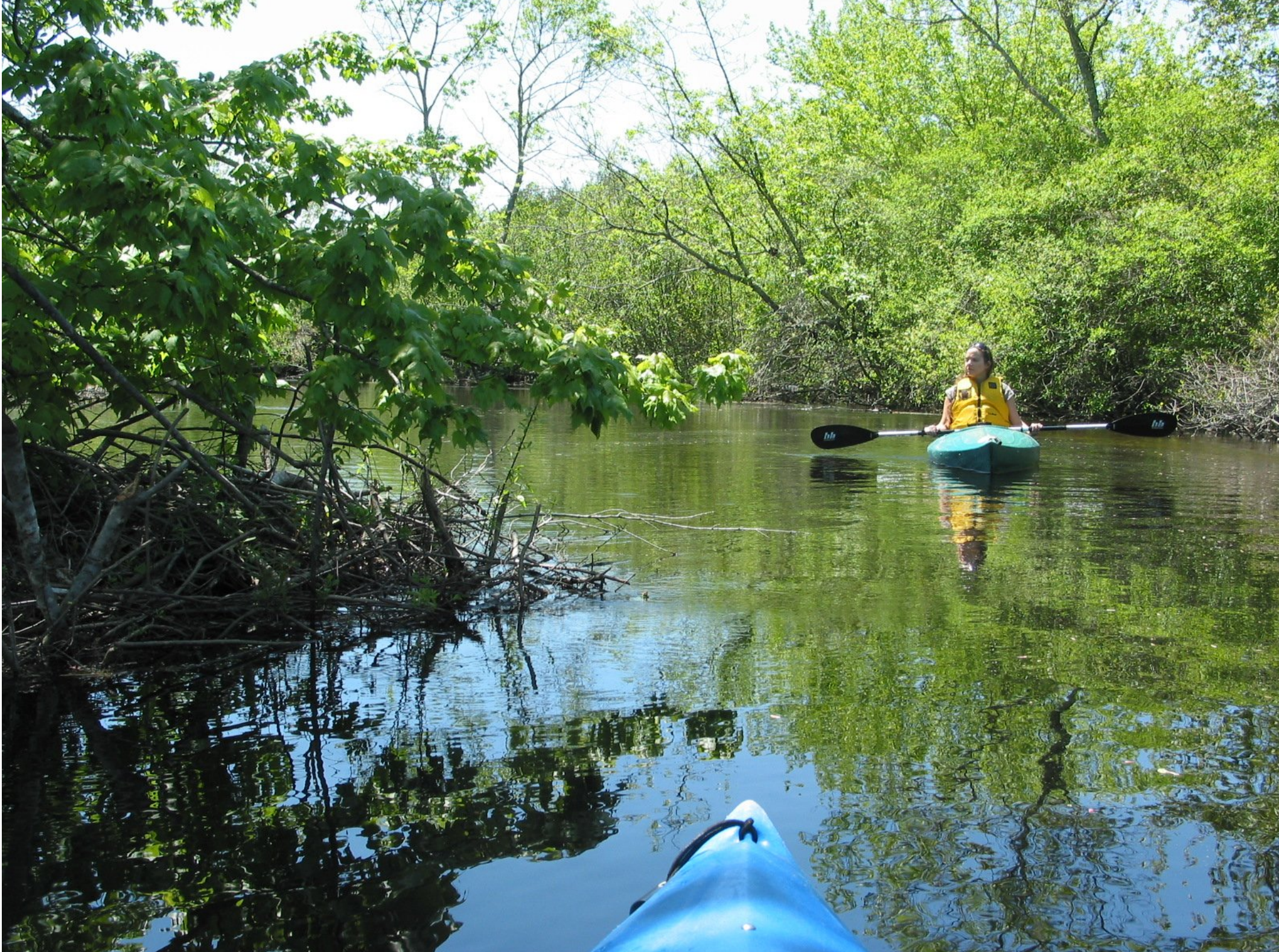
A kayaker paddles on the Wood River.

In 2019, the National Park Service bestowed an unusual honor on Rhode Island and southeastern Connecticut when it recognized the Wood-Pawcatuck Watershed as part of the National Wild and Scenic Rivers Systems .